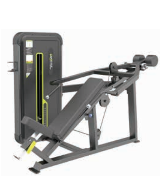
E3013A Incline Press

Tube Thickness: 2.5 mm Dimension: 155 x 137 x 236 cm Weight: 289 kg