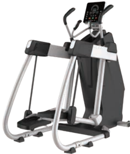
X9100 Prone Leg Curl

Resistance: Magnetron Dimension: 175 x 64.5 x 140 cm Weight: 138 kg