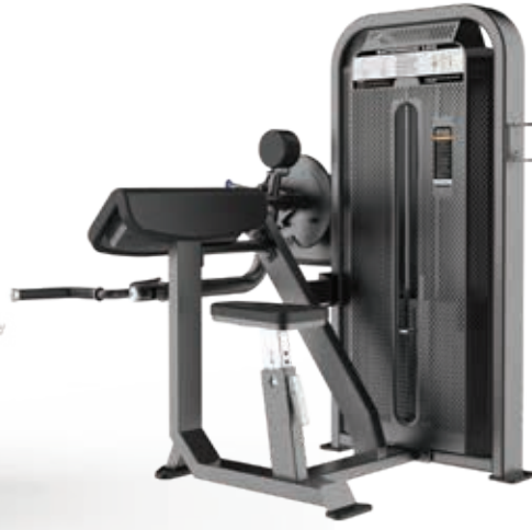
E4087A Camber Curl and Triceps

Tube Thickness: 2.5 mm Dimension: 164.5 x 124.5 x 136cm Weight: 235 kg