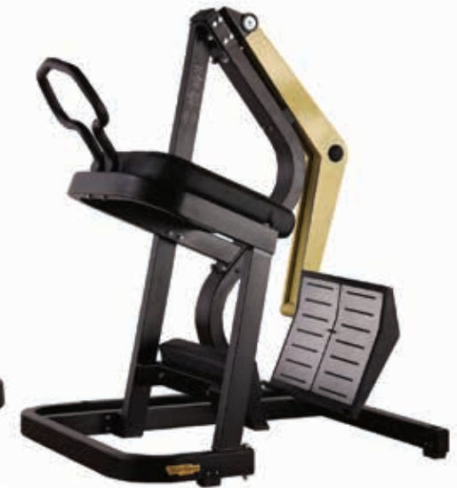
D940S Rear Kick

Tube Thickness: 3 mm Dimension: 129 x 126 x 148.5 cm Weight: 140 kg