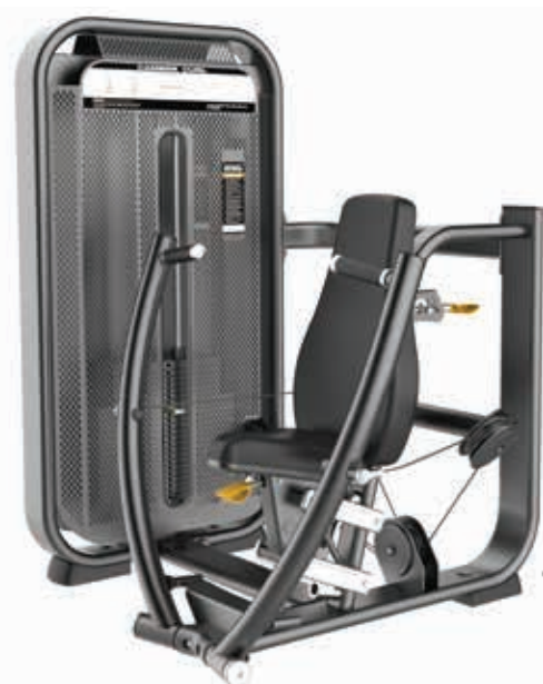
E7008 Vertical Press

Tube Thickness: 3 mm Dimension: 128 x 142 x 207.5 cm Weight: 242 kg