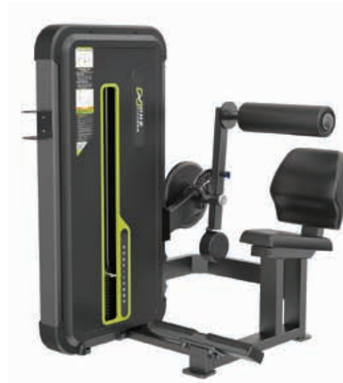
E3073A Abdominal Isolator

Tube Thickness: 2.5 mm Dimension: 185 x 109 x 234 cm Weight: 248 kg