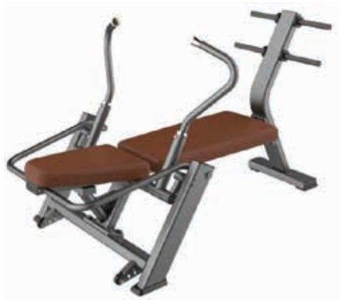
E1070 Abdominal Trainer

Tube Thickness: 3 mm Dimension: 157 x 93 x 102cm Weight: 68 kg