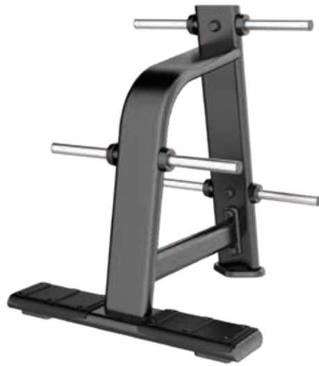
E7054 Vertical Plate Tree

Tube Thickness: 3 mm Dimension: 125.5 x 110 x 179.5 cm Weight: 108 kg