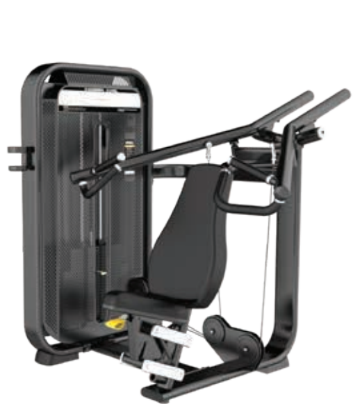
E7006 Shoulder Press

Tube Thickness: 3 mm Dimension: 130 x 97 x 153 cm Weight: 250 kg