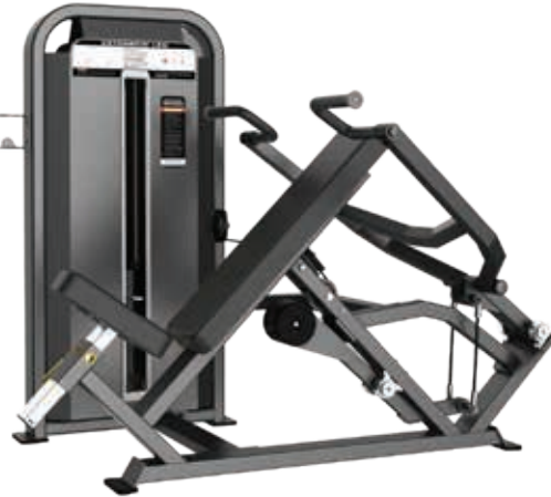
E5006 Shoulder Press

Tube Thickness: 2.5 mm Dimension: 91 x 115 x 150 cm Weight: 195 kg