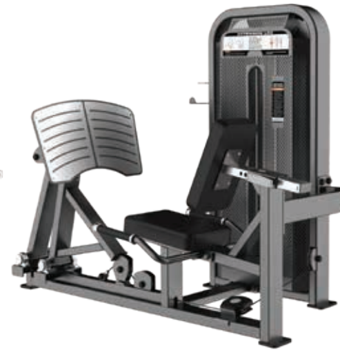
E4003A Leg Press

Tube Thickness: 2.5 mm Dimension: 140 x 105 x 150 cm Weight: 214 kg