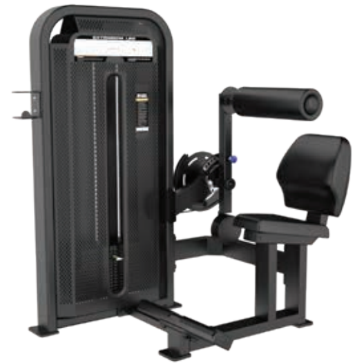
E4073A Abdominal Isolator

Tube Thickness: 2.5 mm Dimension: 185 x 109 x 234 cm Weight: 248 kg