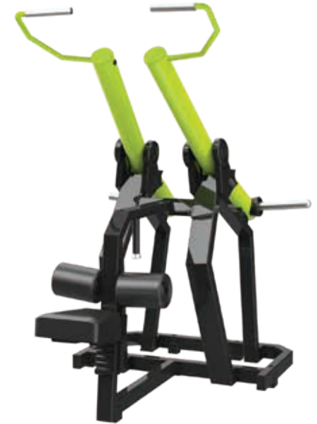
Y920Z Pull Down

Tube Thickness: 3 mm Dimension: 145 x 118.2 x 171.5 cm Weight: 170 kg