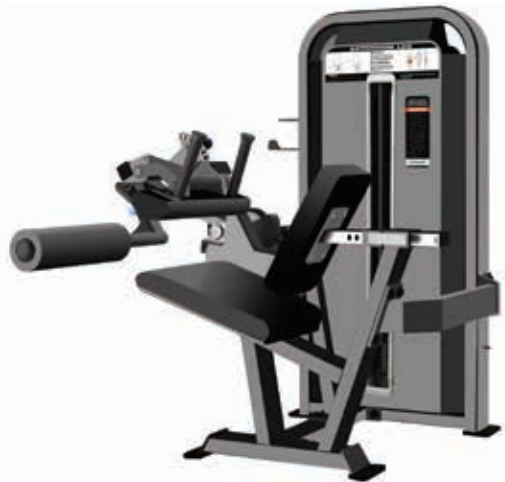
E5023 Seated Leg Curl

Tube Thickness: 2.5 mm Dimension: 105 x 120 x 150 cm Weight: 214 kg