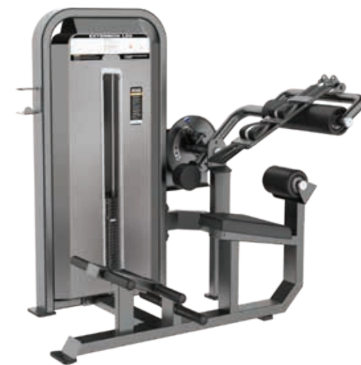
E5088 Abdominal and Back Extension

Tube Thickness: 2.5 mm Dimension: 189 x 124.5 x 132 cm Weight: 230 kg