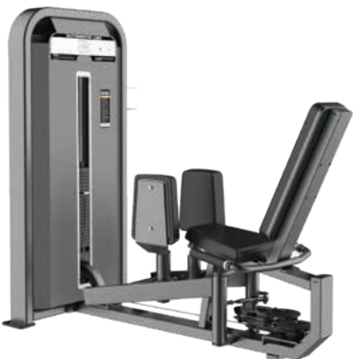
E5089 Abductor and Adductor

Tube Thickness: 2.5 mm Dimension: 152 x 124.5 x 187.5 cm Weight: 230 kg