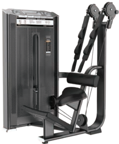
E7073A Abdominal Isolator

Tube Thickness: 3 mm Dimension: 152 x 144.5 x 179.5cm Weight: 270 kg