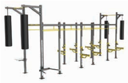
E6204 Multi Bridge

Tube Thickness: 3 mm Dimension: 862 x 285 x 350 cm Weight: 760 kg