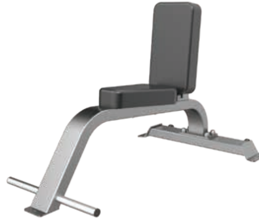
E3038 Multi-Purpose Bench

Tube Thickness: 2.5 mm Dimension: 162 x 76 x 81 cm Weight: 61 kg