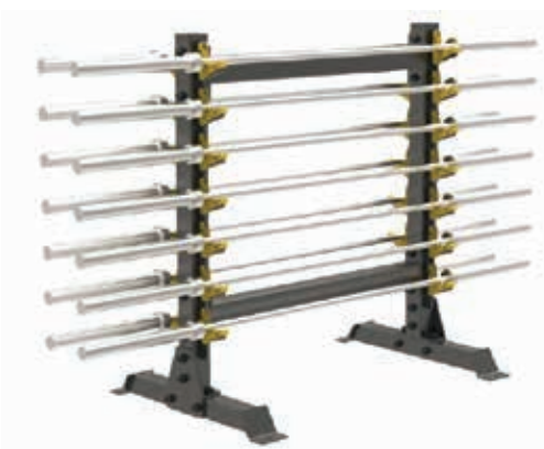
E6231 Barbell Rack

Tube Thickness: 3 mm Dimension: 433.5 x 104 x 126 cm Weight: 265 kg