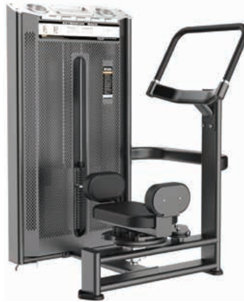
E7018A Rotary Torso

Tube Thickness: 3 mm Dimension: 119 x 123 x 223 cm Weight: 242 kg