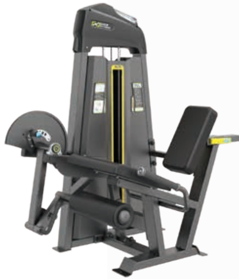
E3002 Leg Extension

Tube Thickness: 2.5 mm Dimension: 152 x 99 x 162cm Weight: 216 kg