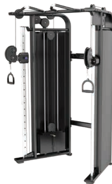
E7017 FTS Dual Adjustable Pulley

Tube Thickness: 3 mm Dimension: 119 x 123 x 223 cm Weight: 242 kg