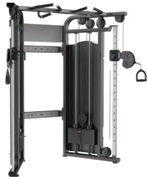
E1017C Commercial Functional Trainer

Tube Thickness: 3 mm Dimension: 425 x 68 x 240 cm Weight: 485 kg