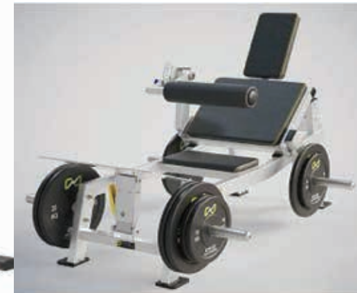
E3092 Glute Maker

Tube Thickness: 3 mm Dimension: 165 x 146.5 x 785 cm Weight: 80 kg