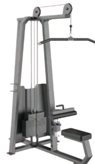
T1035 Pull Down

Tube Thickness: 2.5 mm Dimension: 155 x 132 x 160 cm Weight: 194 kg