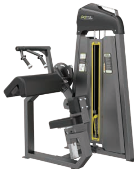
E3028 Triceps Extension

Tube Thickness: 2.5 mm Dimension: 114 x 94 x 162 cm Weight: 191 kg