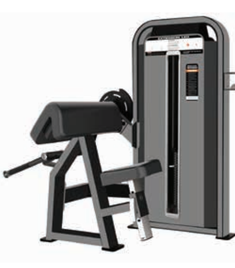
E5030 Camber Curl

Tube Thickness: 2.5 mm Dimension: 110 x 95 x 150 cm Weight: 191 kg