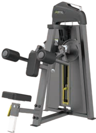
E3005 Lateral Raise

Tube Thickness: 2.5 mm Dimension: 87 x 150 x 162cm Weight: 200 kg