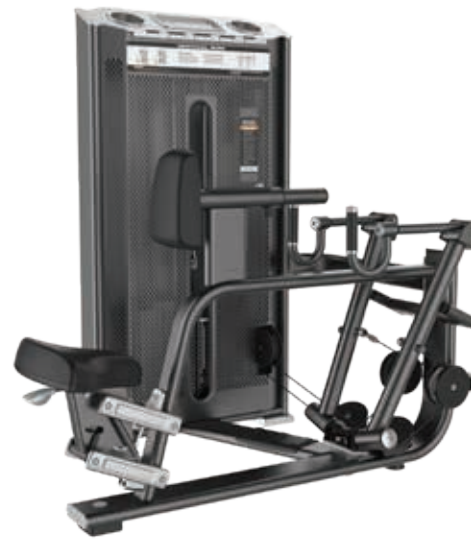
E7034A Vertical Row

Tube Thickness: 3 mm Dimension: 178 x 132 x 153 cm Weight: 242 kg