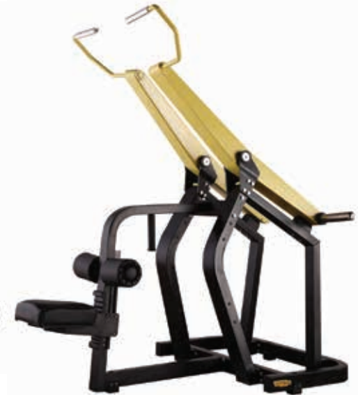
D920S Pull Down

Tube Thickness: 3 mm Dimension: 154 x 103 x 168.5 cm Weight: 160 kg