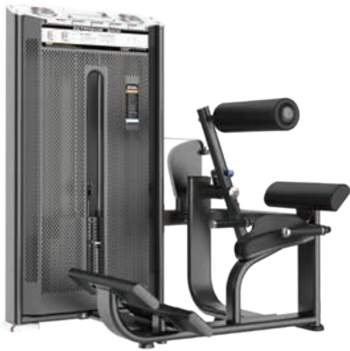
E7031A Back Extension

Tube Thickness: 3 mm Dimension: 128.5 x 105.5 x 153 cm Weight: 260 kg