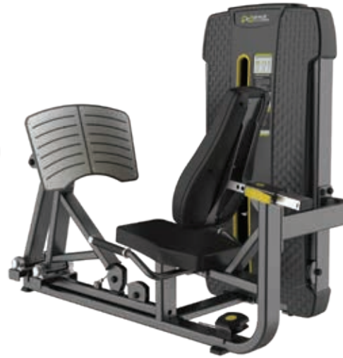
E4003 Leg Press

Tube Thickness: 3 mm Dimension: 140 x 105 x 150 cm Weight: 234 kg