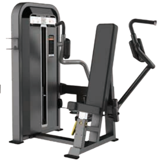
E5004 Pectoral Machine

Tube Thickness: 2.5 mm Dimension: 185 x 105 x 150 cm Weight: 255 kg