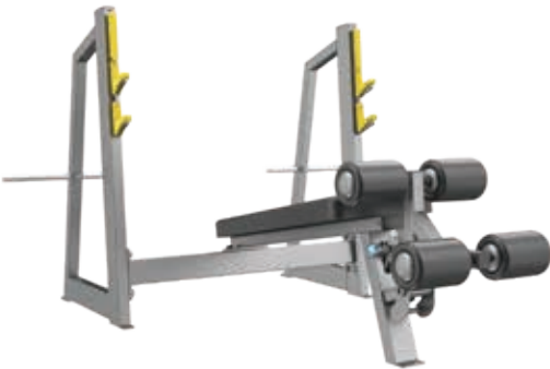
E3041 Olympic Decline Bench

Tube Thickness: 2.5 mm Dimension: 162 x 76 x 81 cm Weight: 61 kg