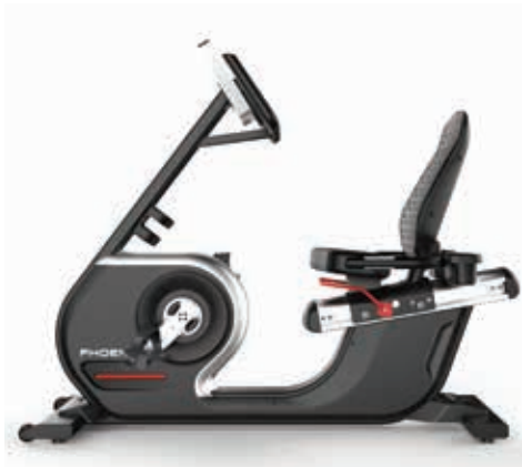
A5100 Recumbent Bike

Resistance: Magnetron Dimension: 120 x 63 x 153 cm Weight: 125 kg