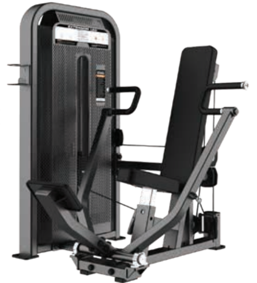
E4008A Vertical Press

Tube Thickness: 2.5 mm Dimension: 124 x 94 x 211 cm Weight: 227 kg