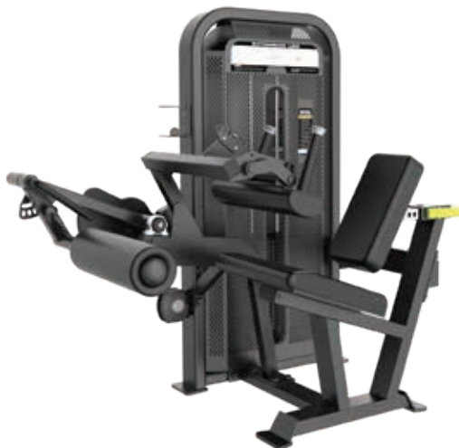
E4023A Seated Leg Curl

Tube Thickness: 2.5 mm Dimension: 105 x 120 x 150 cm Weight: 214 kg