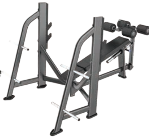
E7041 Olympic Decline Bench

Tube Thickness: 3 mm Dimension: 136 x 69 x 50.5cm Weight: 48 kg