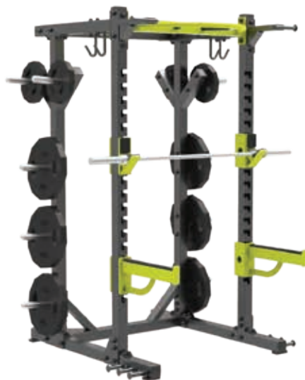
E6221 Half Rack

Tube Thickness: 3 mm Dimension: 869 x 285 x 405 cm Weight: 790 kg