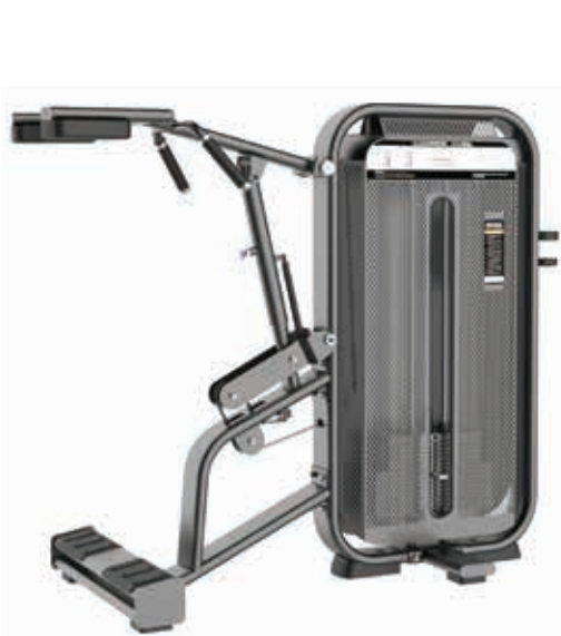
E7010 Standing Calf

Tube Thickness: 3 mm Dimension: 186 x 82 x 153 cm Weight: 280 kg