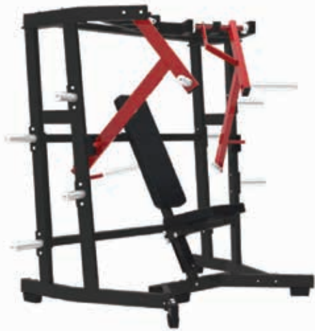
2014Z Wide Chest Press

Tube Thickness: 2.5 mm Dimension: 130 x 160 x 153 cm Weight: 148 kg