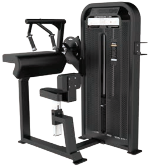
E4027A Seated Tricep Flat

Tube Thickness: 2.5 mm Dimension: 120 x 98 x 150 cm Weight: 191 kg