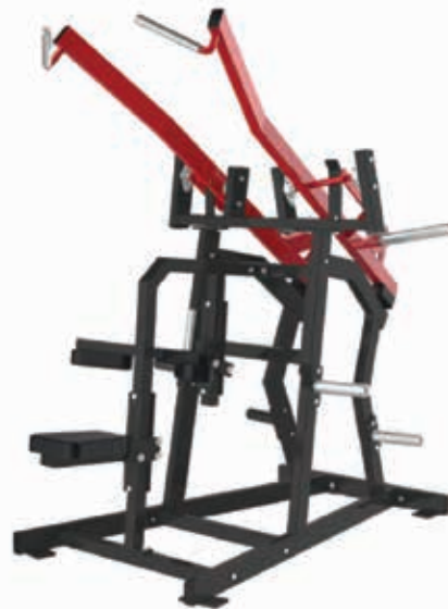
2015Z Wide Pull Down

Tube Thickness: 2.5 mm Dimension: 199 x 123 x 178 cm Weight: 182 kg