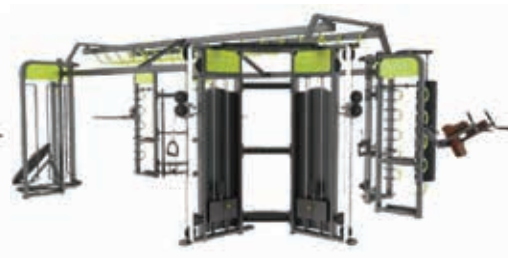
E360 C Small Group Training

Dimension: 760 x 521 x 256 cm Weight: 1420 kg