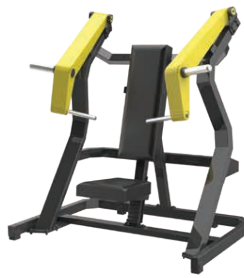
D915Z Incline Chest Press

Tube Thickness: 3 mm Dimension: 145 x 118.2 x 171.5 cm Weight: 170 kg