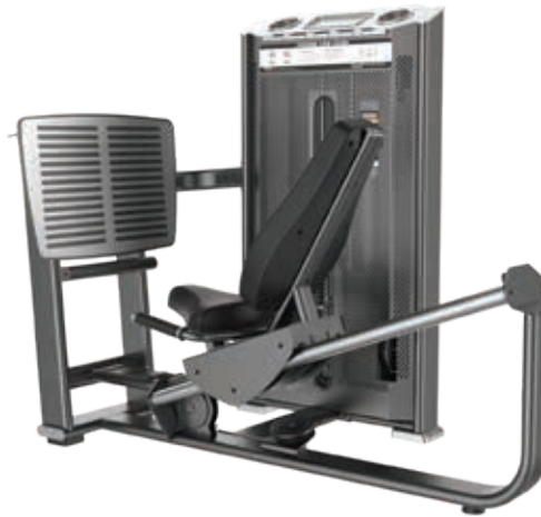
E7003A Leg Press

Tube Thickness: 3 mm Dimension: 142.5 x 116.5 x 153 cm Weight: 250 kg