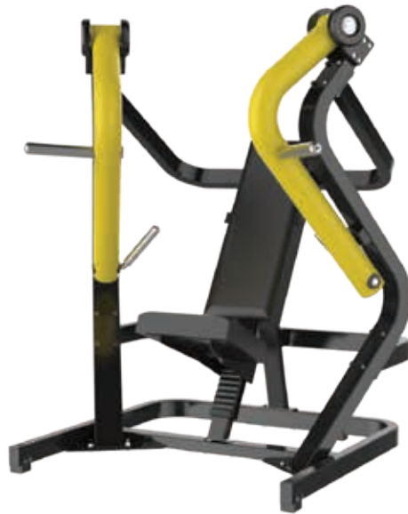
Y910S Wide Chest Press

Tube Thickness: 3 mm Dimension: 150 x 120 x 171.5 cm Weight: 164 kg