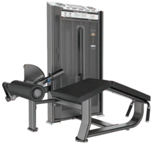
E7001A Prone Leg Curl

Tube Thickness: 3 mm Dimension: 161 x 109.5 x 153 cm Weight: 255 kg