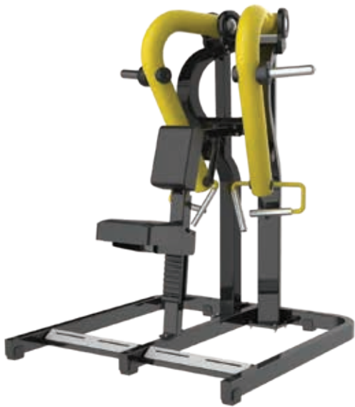
Y925S Low Row

Tube Thickness: 3 mm Dimension: 111 x 174 x 199 cm Weight: 150 kg