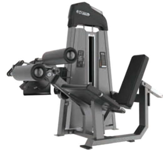
E3073 Abdominal Isolator

Tube Thickness: 2.5 mm Dimension: 130 x 89 x 162 cm Weight: 235 kg