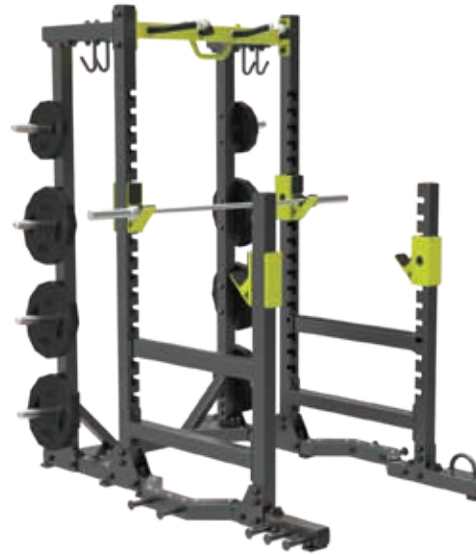
E6226 Multi Rack

Tube Thickness: 3 mm Dimension: 241.5 x 247.5 x 305 cm Weight: 430 kg