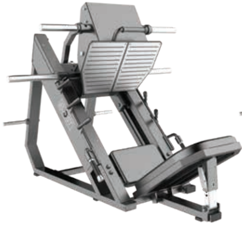
E3056 Angled Leg Press

Tube Thickness: 2.5 mm Dimension: 217 x 161 x 126 cm Weight: 172 kg