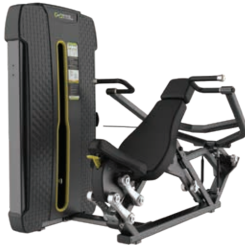
E4006 Shoulder Press

Tube Thickness: 3 mm Dimension: 152 x 99 x 135 cm Weight: 205 kg