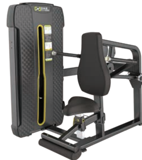
E4026 Seated Dip

Tube Thickness: 3 mm Dimension: 130 x 96 x 150 cm Weight: 155 kg