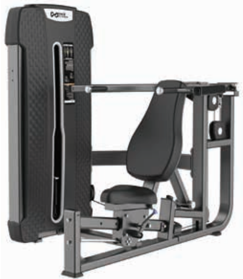
E4084 Chest and Shoulder Press

Tube Thickness: 3 mm Dimension: 200 x 135 x 162 cm Weight: 257 kg