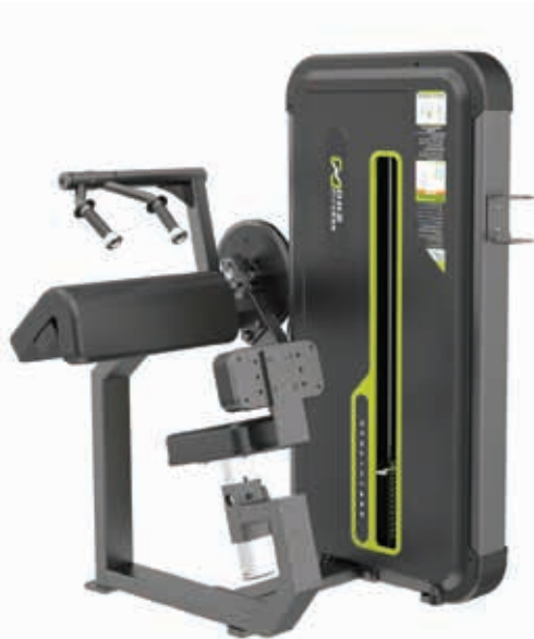
E3028A Triceps Extension

Tube Thickness: 2.5 mm Dimension: 120 x 98 x 150 cm Weight: 191 kg