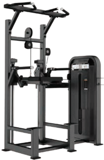
E4009A Dip/Chin Assist

Tube Thickness: 2.5 mm Dimension: 155 x 137 x 236 cm Weight: 289 kg