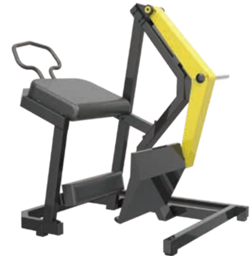
D940Z Rear Kick

Tube Thickness: 3 mm Dimension: 129 x 126 x 148.5 cm Weight: 140 kg