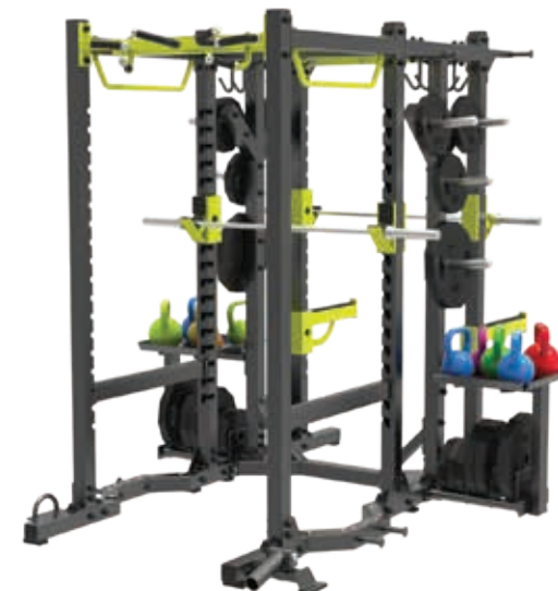
E6223 Combo Rack

Tube Thickness: 3 mm Dimension: 246 x 182 x 246.5 cm Weight: 650 kg