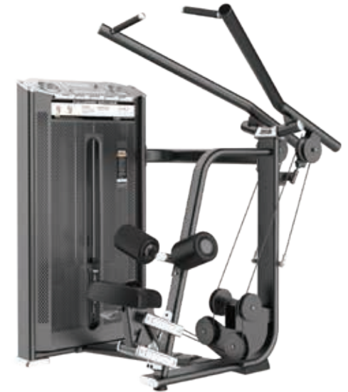
E7035A Pull Down

Tube Thickness: 3 mm Dimension: 150.5 x 100.5 x 153 cm Weight: 255 kg