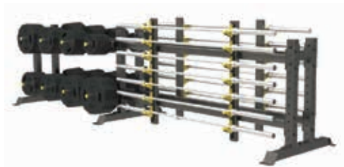
E6230 Multi Rack

Tube Thickness: 2.5 mm Dimension: 181 x 121 x 124 cm Weight: 100 kg