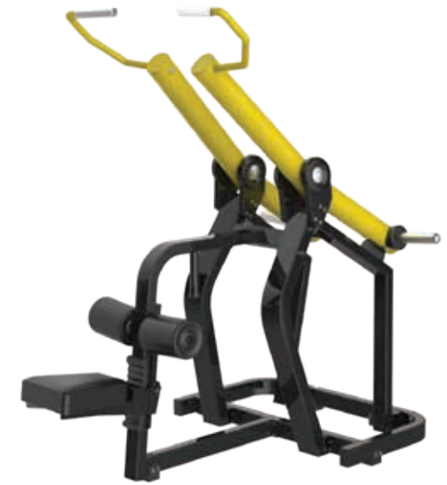
Y920S Pull Down

Tube Thickness: 3 mm Dimension: 154 x 103 x 168.5 cm Weight: 160 kg