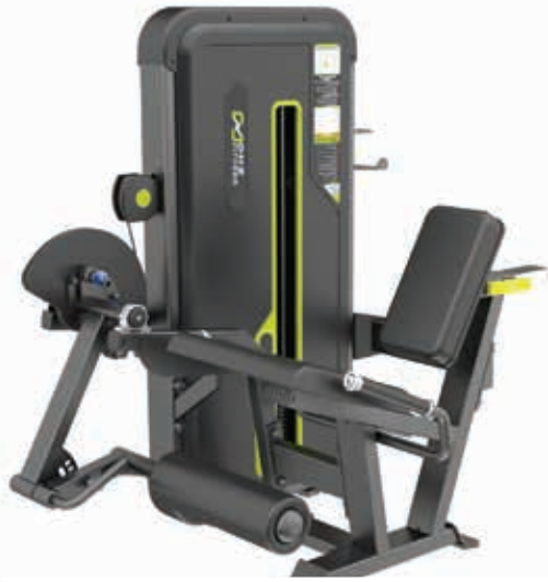
E3002A Leg Extension

Tube Thickness: 2.5 mm Dimension: 180 x 97 x 150 cm Weight: 205 kg