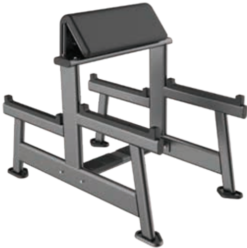
E7044 Seated Preacher Curl

Tube Thickness: 3 mm Dimension: 201.5 x 181.5 x 131 cm Weight: 72 kg