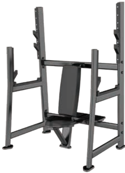
E7051 Olympic Seated Bench

Tube Thickness: 3 mm Dimension: 125.5 x 110 x 179.5 cm Weight: 108 kg