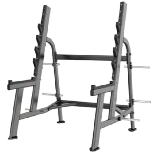
E7050 Squat Rack

Tube Thickness: 3 mm Dimension: 104 x 72 x 165 cm Weight: 60 kg