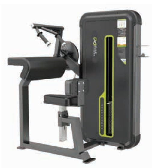
E3027A Seated Tricep Flat

Tube Thickness: 2.5 mm Dimension: 120 x 98 x 150 cm Weight: 191 kg