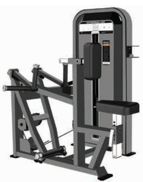
E5033 Long Pull

Tube Thickness: 2.5 mm Dimension: 121 x 100 x 150 cm Weight: 235 kg