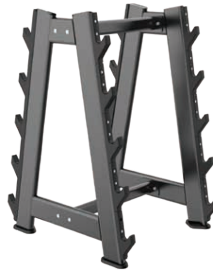
E7055 Barbell Rack

Tube Thickness: 3 mm Dimension: 68 x 69 x 79.5cm Weight: 24 kg