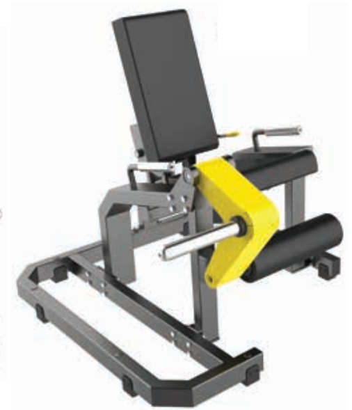
D960Z Leg Extension

Tube Thickness: 3 mm Dimension: 119 x 138 x 130 cm Weight: 135 kg