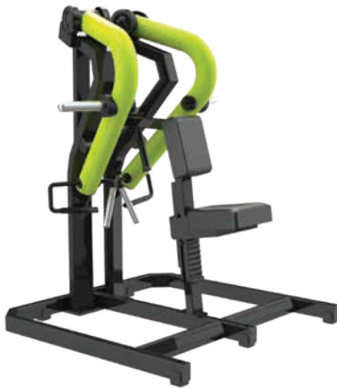
Y925Z Low Row

Tube Thickness: 3 mm Dimension: 154 x 103 x 168.5 cm Weight: 160 kg