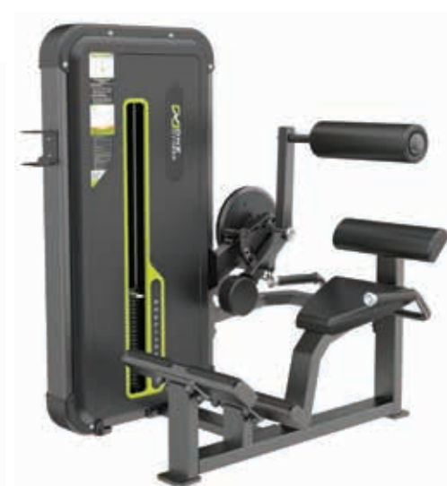
E3031A Back Extension

Tube Thickness: 2.5 mm Dimension: 120 x 91 x 150 cm Weight: 162 kg