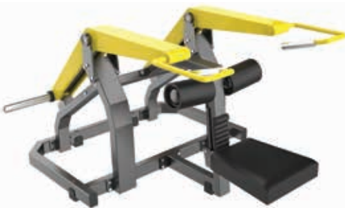
D965Z Seated Dip

Tube Thickness: 3 mm Dimension: 119 x 138 x 130 cm Weight: 135 kg