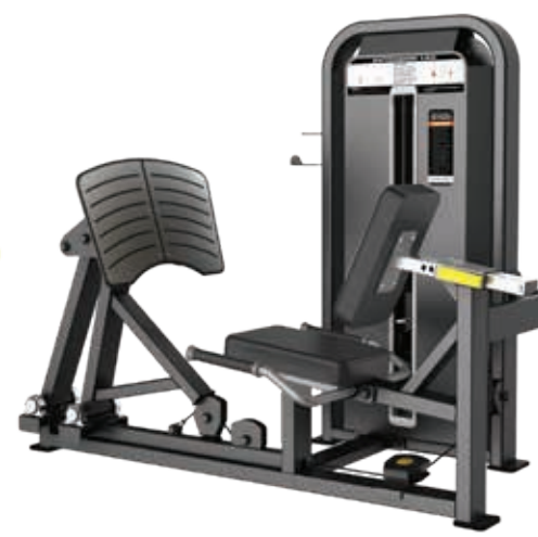
E5003 Leg Press

Tube Thickness: 2.5 mm Dimension: 140 x 105 x 150 cm Weight: 214 kg