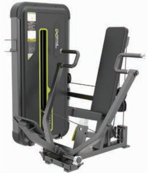
E3008A Vertical Press

Tube Thickness: 2.5 mm Dimension: 124 x 94 x 211 cm Weight: 227 kg