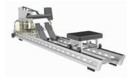
E6101 Water Rowing Machine

Resistance: Magnetron Dimension: 228 x 80 x 189 cm Weight: 280 kg