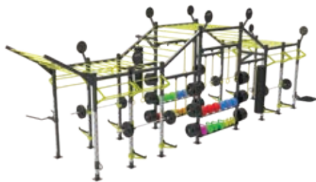
E6205 Angled Multi Bridge

Tube Thickness: 3 mm Dimension: 862 x 285 x 350 cm Weight: 760 kg