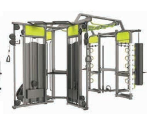
Small Group Training

Dimension: 495 x 300 x 236 cm Weight: 620 kg