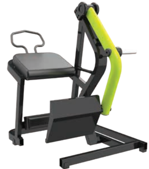
Y940Z Rear Kick

Tube Thickness: 3 mm Dimension: 129 x 126 x 148.5 cm Weight: 140 kg