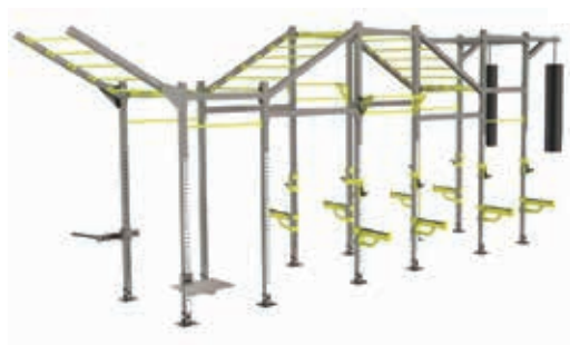
E6208 Angled Bridge

Tube Thickness: 3 mm Dimension: 953 x 334 x 321.5 cm Weight: 850 kg