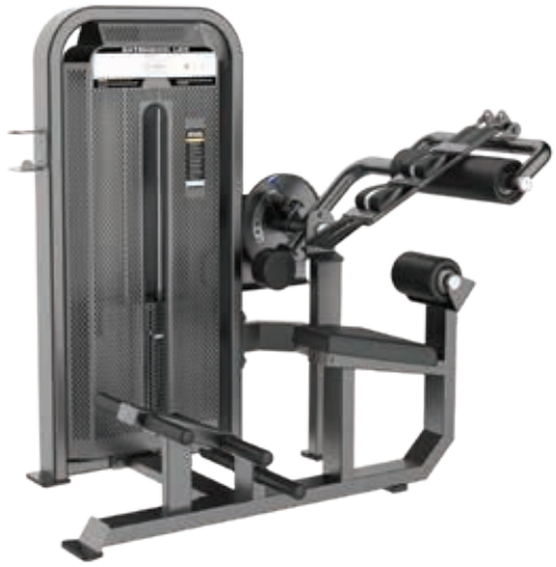
E4088A Abdominal Isolator and Back Extension

Tube Thickness: 2.5 mm Dimension: 189 x 124.5 x 132 cm Weight: 230 kg