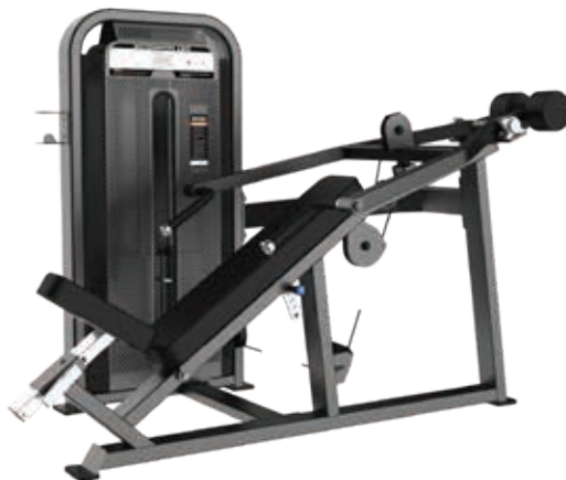
E4013A Incline Press

Tube Thickness: 2.5 mm Dimension: 155 x 137 x 236 cm Weight: 289 kg