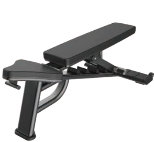
E7039 Super Bench

Tube Thickness: 3 mm Dimension: 136 x 69 x 50.5cm Weight: 48 kg