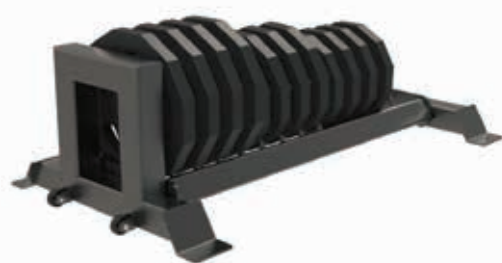
E6233 Weight Plate Base

Tube Thickness: 3 mm Dimension: 129 x 82 x 140.5 cm Weight: 70 kg