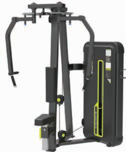
E3007A Pearl Delt/ Pec Fly

Tube Thickness: 2.5 mm Dimension: 190 x 135 x 150 cm Weight: 231 kg