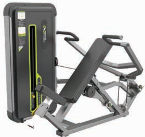
E3006A Shoulder Press

Tube Thickness: 2.5 mm Dimension: 91 x 115 x 150 cm Weight: 195 kg