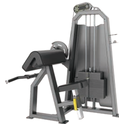
T1030 Camber Curl

Tube Thickness: 2.5 mm Dimension: 118 x 94 x 163cm Weight: 190 kg