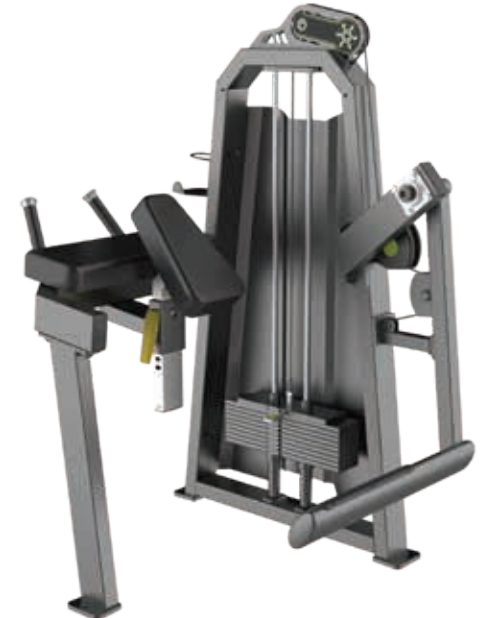
T1024 Glute Isolator

Tube Thickness: 2.5 mm Dimension: 151 x 106 x 162cm Weight: 220 kg