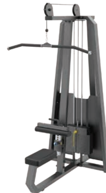
E3035 Lat Pull Down

Tube Thickness: 2.5 mm Dimension: 155 x 132 x 162cm Weight: 194 kg