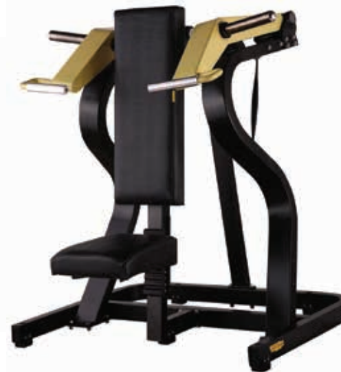
D935S Shoulder Press

Tube Thickness: 3 mm Dimension: 119 x 138 x 130 cm Weight: 135 kg