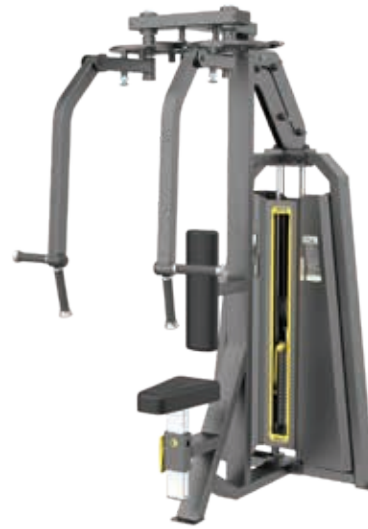
E3007 Pearl Delt/ Pec Fly

Tube Thickness: 2.5 mm Dimension: 185 x 120 x 162cm Weight: 239 kg