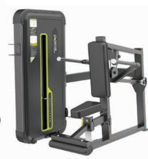
E3026A Seated Dip

Tube Thickness: 2.5 mm Dimension: 130 x 96 x 150 cm Weight: 135 kg