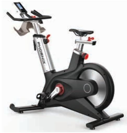
S300 Indoor Cycling Bike

Resistance: Magnetron Dimension: 126 x 50 x 100 cm Weight: 41.5 kg