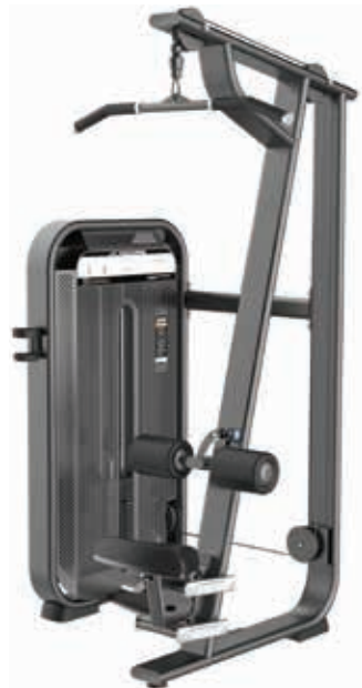
E7012 Lat Pull Down

Tube Thickness: 3 mm Dimension: 186 x 82 x 153 cm Weight: 280 kg