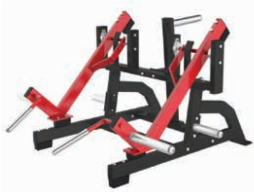
2029Z Standing Shrug

Tube Thickness: 2.5 mm Dimension: 152 x 163 x 90 cm Weight: 103.5 kg