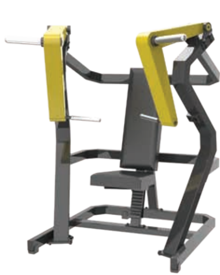
D905Z Chest Press

Tube Thickness: 3 mm Dimension: 150 x 120 x 171.5 cm Weight: 164 kg