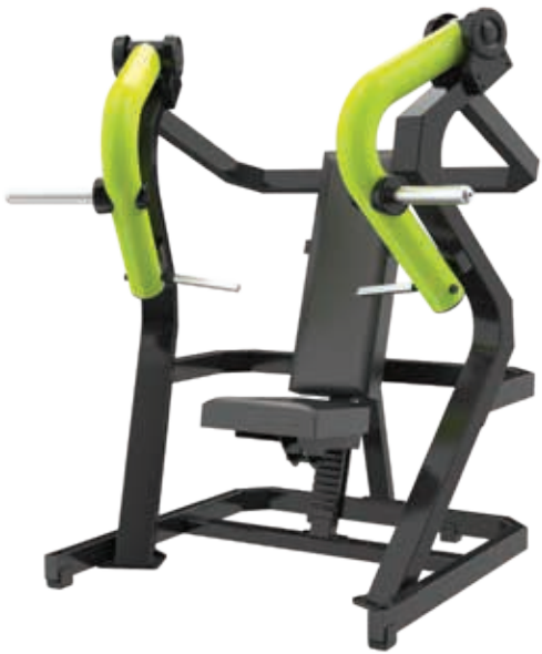
Y905Z Chest Press

Tube Thickness: 3 mm Dimension: 150 x 120 x 171.5 cm Weight: 164 kg