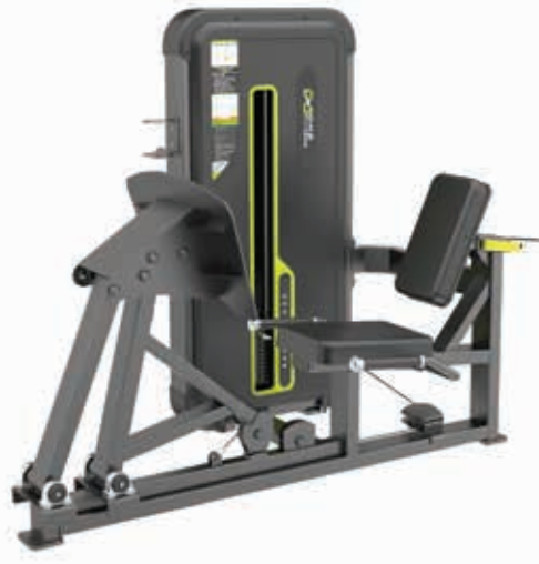
E3003A Leg Press

Tube Thickness: 2.5 mm Dimension: 140 x 105 x 150 cm Weight: 214 kg