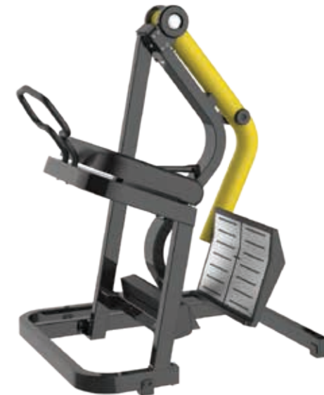
Y940S Rear Kick

Tube Thickness: 3 mm Dimension: 129 x 126 x 148.5 cm Weight: 140 kg