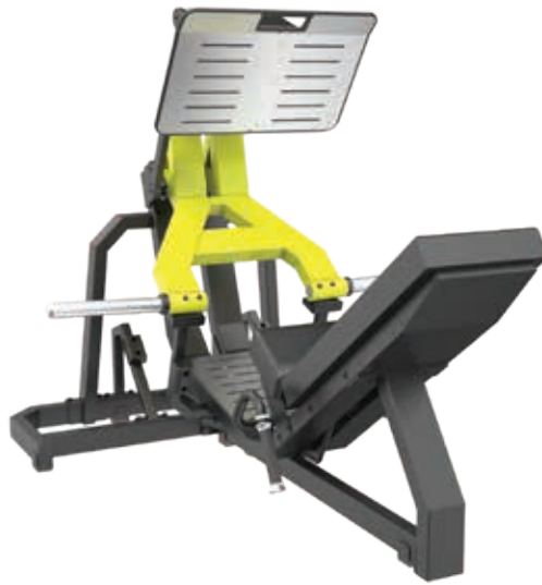
D950Z Leg Press

Tube Thickness: 3 mm Dimension: 112 x 171 x 117 cm Weight: 150 kg