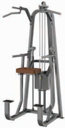
T1009 Dip/Chin Assist

Tube Thickness: 2.5 mm Dimension: 155 x 137 x 236cm Weight: 289 kg