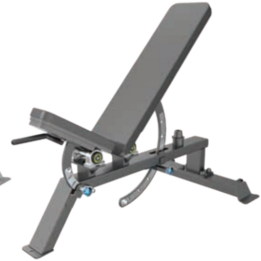
E3039 Super Bench

Tube Thickness: 2.5 mm Dimension: 117 x 76 x 82 cm Weight: 30 kg