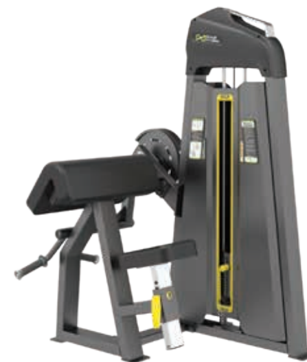
E3030 Camber Curl

Tube Thickness: 2.5 mm Dimension: 114 x 94 x 162 cm Weight: 191 kg