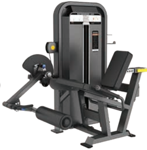
E5002 Leg Extension

Tube Thickness: 2.5 mm Dimension: 180 x 97 x 150 cm Weight: 205 kg