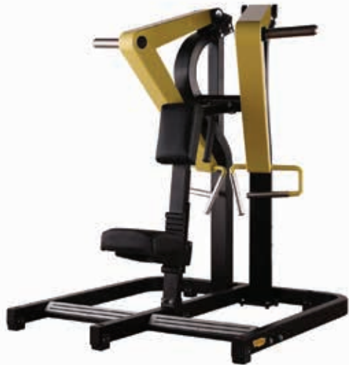
D925S Low Row

Tube Thickness: 3 mm Dimension: 111 x 174 x 199 cm Weight: 150 kg