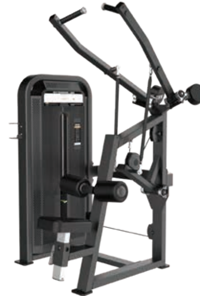
E4035A Pull Down

Tube Thickness: 2.5 mm Dimension: 150 x 130 x 150 cm Weight: 194 kg