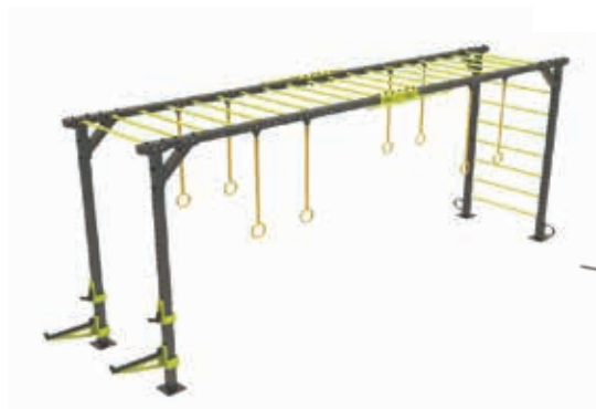
E6206 Single Bridge

Tube Thickness: 3 mm Dimension: 1110 x 334 x 404 cm Weight: 1155 kg