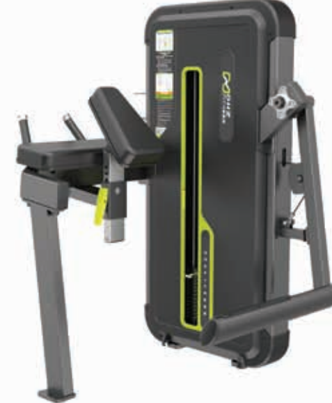
E3024A Glute Isolator

Tube Thickness: 2.5 mm Dimension: 158 x 105 x 150 cm Weight: 220 kg