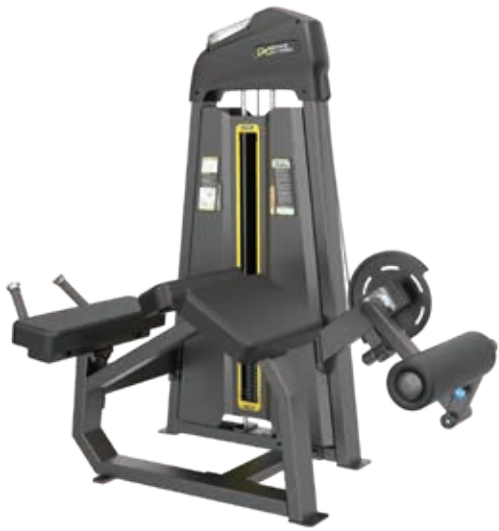
E3001 Prone Leg Curl

Tube Thickness: 2.5 mm Dimension: 152 x 99 x 162cm Weight: 216 kg