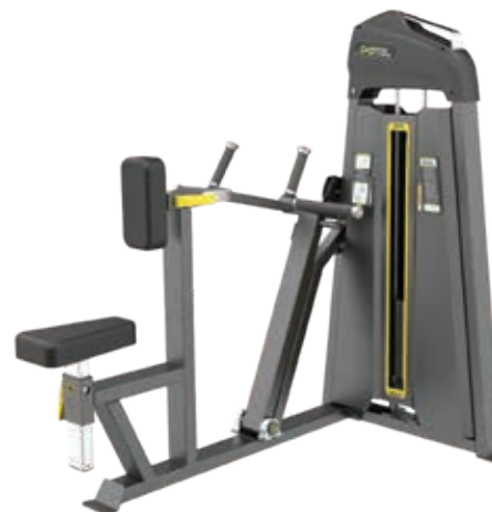
E3034 Vertical Row

Tube Thickness: 2.5 mm Dimension: 282 x 109 x 223 cm Weight: 268 kg