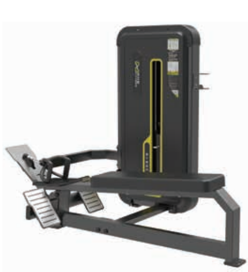
E3033A Long Pull

Tube Thickness: 2.5 mm Dimension: 121 x 100 x 150 cm Weight: 235 kg