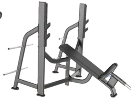
E7042 Olympic Incline Bench

Tube Thickness: 3 mm Dimension: 214.5 x 181.5 x 131 cm Weight: 100 kg