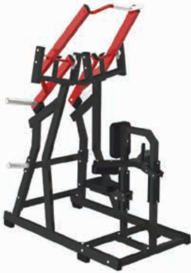
2005Z Vertical Traction

Tube Thickness: 2.5 mm Dimension: 166 x 116 x 211cm Weight: 148 kg