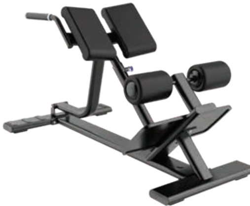
E7045 Back Extension

Tube Thickness: 3 mm Dimension: 131 x 815 x 100.5 cm Weight: 65 kg