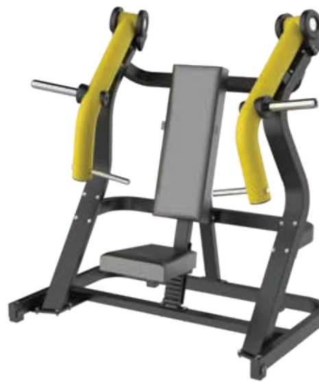
Y915S Incline Chest Press

Tube Thickness: 3 mm Dimension: 145 x 118.2 x 171.5 cm Weight: 170 kg