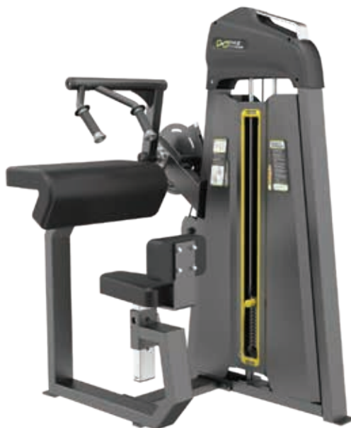
E3027 Seated Tricep-Flat

Tube Thickness: 2.5 mm Dimension: 140 x 107 x 162cm Weight: 230 kg