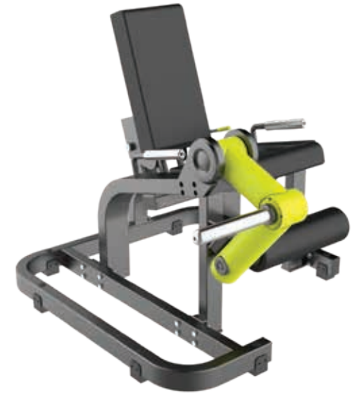
Y960S Leg Extension

Tube Thickness: 3 mm Dimension: 119 x 138 x 130 cm Weight: 135 kg