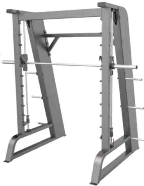
E3063 Smith Machine

Tube Thickness: 2.5 mm Dimension: 150 x 71 x 99 cm Weight: 49 kg