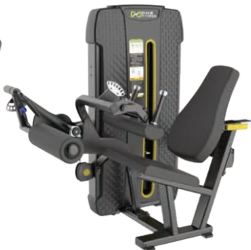
E4023 Seated Leg Curl

Tube Thickness: 3 mm Dimension: 105 x 120 x 150 cm Weight: 234 kg