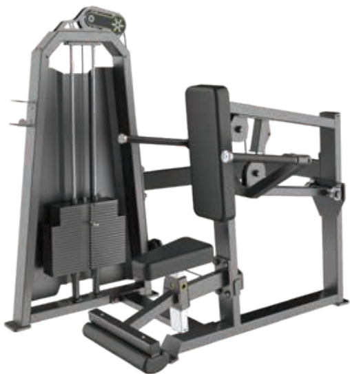
T1026 Seated Dip

Tube Thickness: 2.5 mm Dimension: 140 x 107 x 135cm Weight: 230 kg