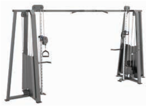
E3016 Cable Crossover

Tube Thickness: 2.5 mm Dimension: 447 x 109 x 231 cm Weight: 396 kg