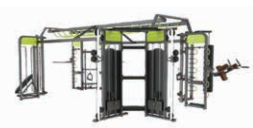
E360 B Small Group Training

Dimension: 860 x 521 x 256 cm Weight: 1500 kg