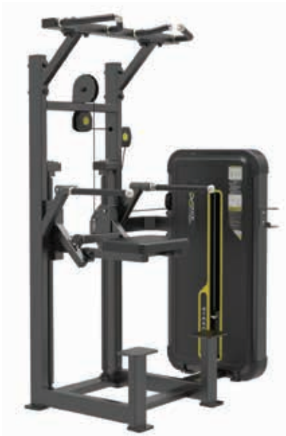
E3009A Dip/Chin Assist

Tube Thickness: 2.5 mm Dimension: 155 x 137 x 236 cm Weight: 289 kg