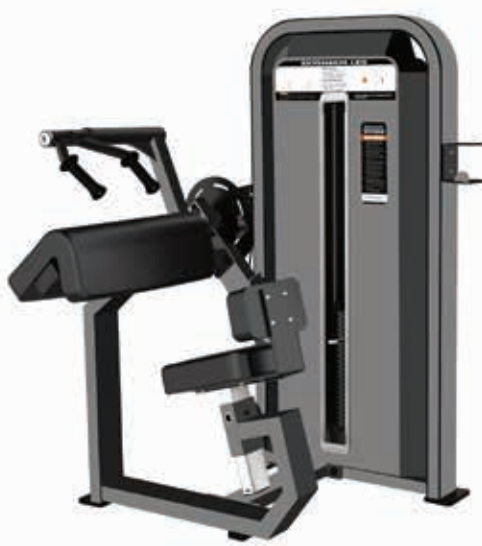
E5028 Triceps Extension

Tube Thickness: 2.5 mm Dimension: 120 x 98 x 150 cm Weight: 191 kg