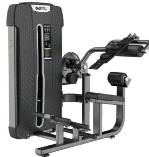
E4088 Abdominal Isolator and Back Extension

Tube Thickness: 3 mm Dimension: 189 x 124.5 x 132 cm Weight: 250 kg