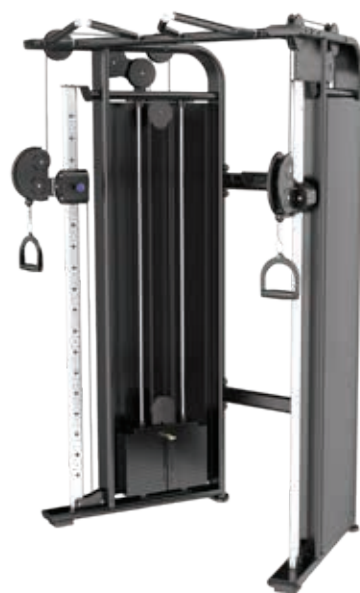
E7017 FTS Dual Adjustable Pulley

Tube Thickness: 3 mm Dimension: 104 x 134 x 199 cm Weight: 282 kg