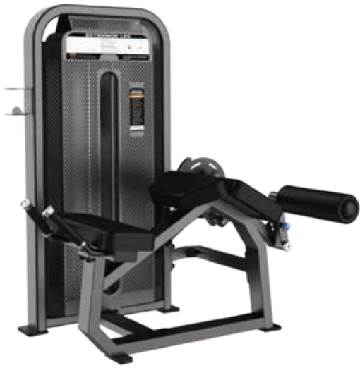
E4001A Prone Leg Curl

Tube Thickness: 2.5 mm Dimension: 180 x 97 x 150 cm Weight: 205 kg