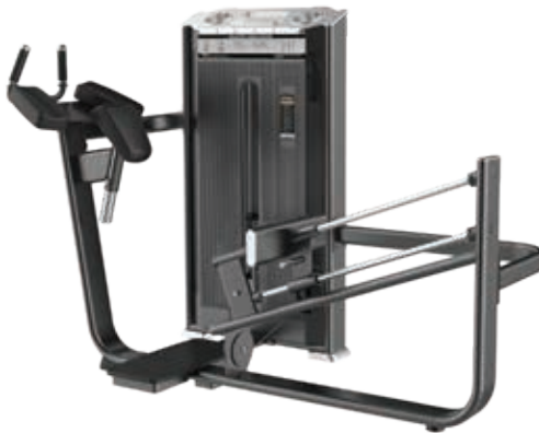
E7024A Glute Isolator

Tube Thickness: 3 mm Dimension: 166.5 x 114.5 x 153 cm Weight: 270 kg