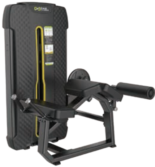
E4001 Prone Leg Curl

Tube Thickness: 3 mm Dimension: 180 x 97 x 150 cm Weight: 216 kg