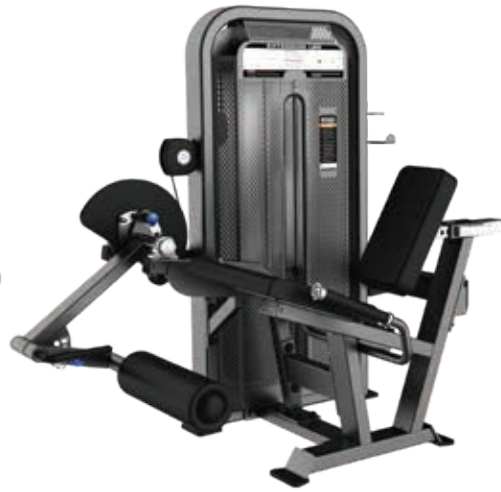
E4002A Leg Extension

Tube Thickness: 2.5 mm Dimension: 180 x 97 x 150 cm Weight: 205 kg