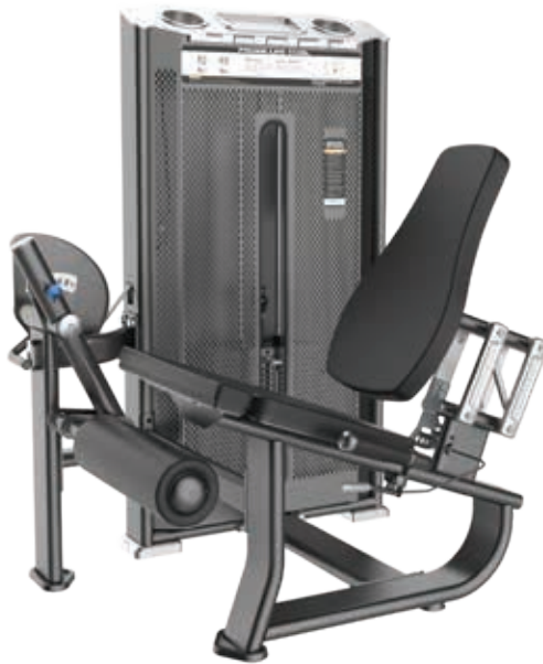
E7002A Leg Extension

Tube Thickness: 3 mm Dimension: 161 x 109.5 x 153 cm Weight: 255 kg