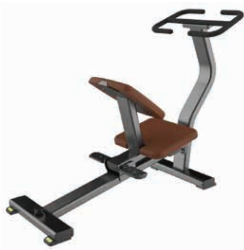
E1071 Stretch Trainer

Tube Thickness: 3 mm Dimension: 157 x 93 x 102cm Weight: 68 kg