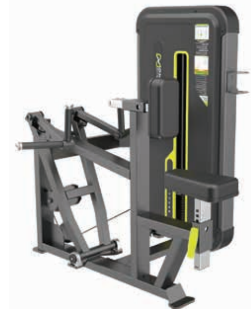
E3034A Vertical Row

Tube Thickness: 2.5 mm Dimension: 282 x 109 x 223 cm Weight: 268 kg