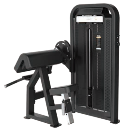
E4030A Camber Curl

Tube Thickness: 2.5 mm Dimension: 110 x 95 x 150 cm Weight: 191 kg