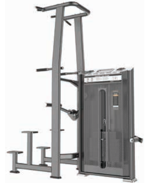
E7009A Dip/Chin Assist

Tube Thickness: 3 mm Dimension: 143.5 x 112.5 x 153 cm Weight: 265 kg