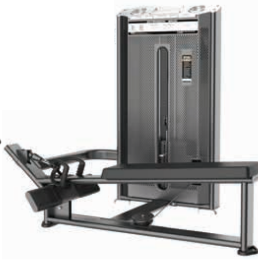
E7033A Long Pull

Tube Thickness: 3 mm Dimension: 128.5 x 105.5 x 153 cm Weight: 260 kg