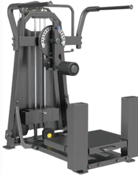
T1011 Multi Hip

Tube Thickness: 2.5 mm Dimension: 155 x 137 x 236cm Weight: 289 kg