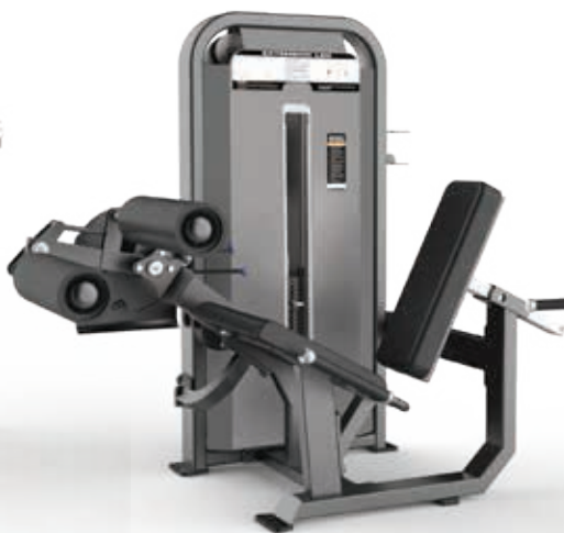
E5086 Leg Extension and Leg Curl

Tube Thickness: 2.5 mm Dimension: 200 x 135 x 162 cm Weight: 237 kg