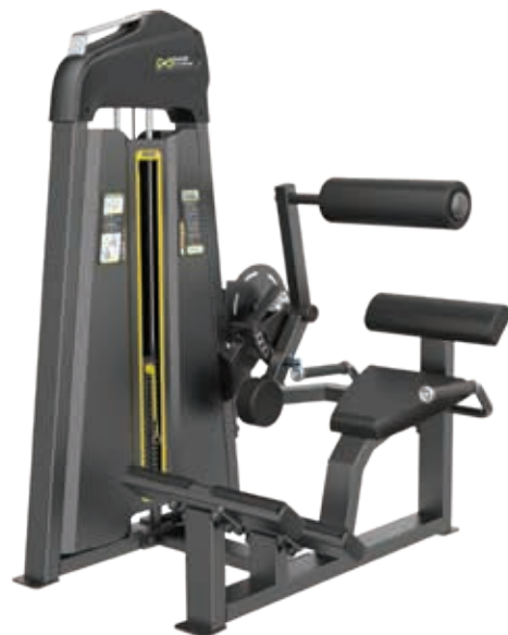
E3031 Back Extension

Tube Thickness: 2.5 mm Dimension: 119 x 89 x 162 cm Weight: 158 kg