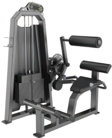
T1031 Back Extension

Tube Thickness: 2.5 mm Dimension: 119 x 89 x 135cm Weight: 168 kg