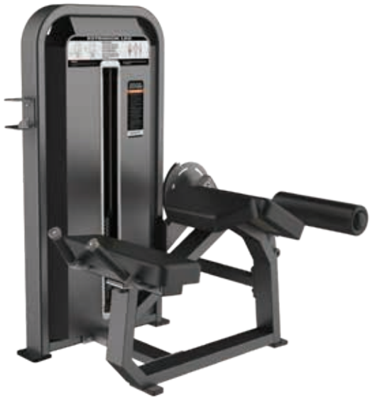
E5001 Prone Leg Curl

Tube Thickness: 2.5 mm Dimension: 180 x 97 x 150 cm Weight: 205 kg