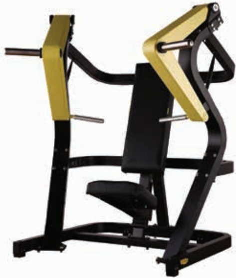
D905S Chest Press

Tube Thickness: 3 mm Dimension: 150 x 120 x 171.5 cm Weight: 164 kg