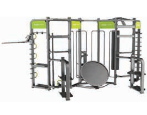
E360 F Small Group Training

Dimension: 325 x 235 x 236 cm Weight: 620 kg