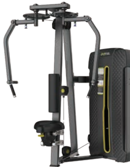
E4007 Pearl Delt/ Pec Fly

Tube Thickness: 3 mm Dimension: 190 x 135 x 150 cm Weight: 251 kg