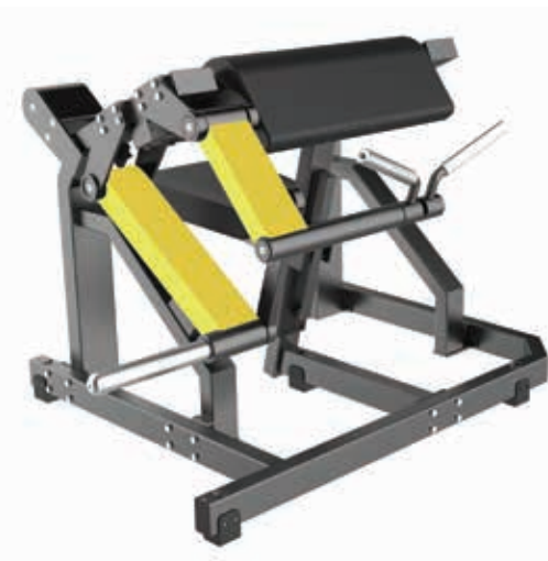
D970Z Biceps Curl

Tube Thickness: 3 mm Dimension: 111.5 x 133 x 165 cm Weight: 140 kg