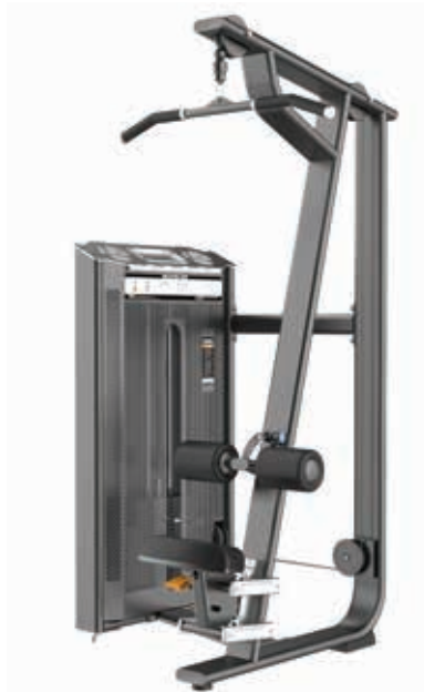
E7012A Lat Pull Down

Tube Thickness: 3 mm Dimension: 186 x 82 x 153 cm Weight: 280 kg