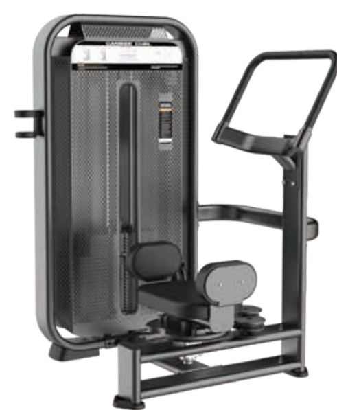
E7018 Rotary Torso

Tube Thickness: 3 mm Dimension: 157 x 111 x 233 cm Weight: 375 kg