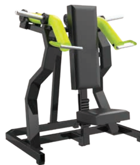
Y935Z Shoulder Press

Tube Thickness: 3 mm Dimension: 119 x 138 x 130 cm Weight: 135 kg