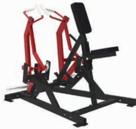
2011Z Low Row

Tube Thickness: 2.5 mm Dimension: 170 x 119 x 2030 cm Weight: 166 kg