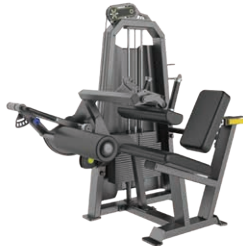
T1023 Seated Leg Curl

Tube Thickness: 2.5 mm Dimension: 155 x 86 x 135cm Weight: 214 kg