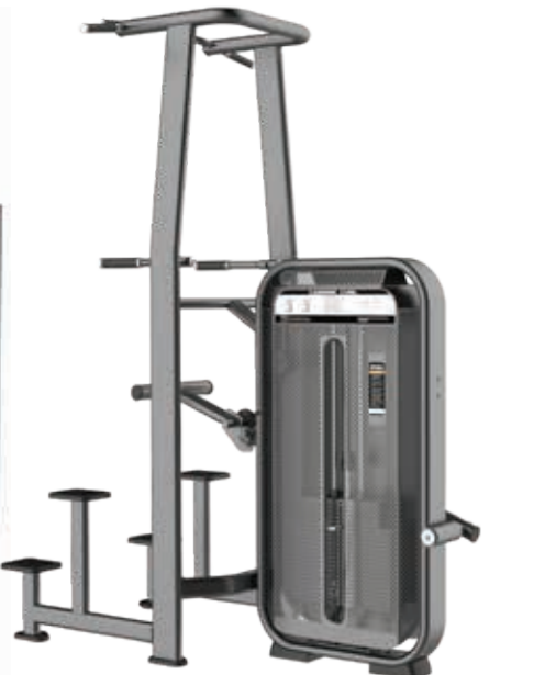
E7009 Dip/Chin Assist

Tube Thickness: 3 mm Dimension: 143.5 x 112.5 x 153 cm Weight: 265 kg