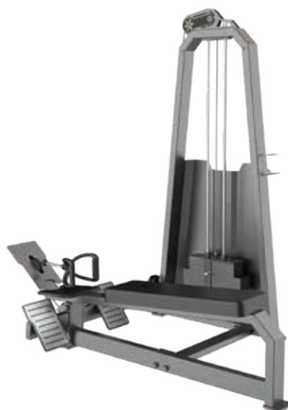
T1033 Long Pull

Tube Thickness: 2.5 mm Dimension: 130 x 89 x 135cm Weight: 255 kg