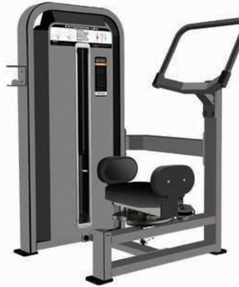
E5018 Rotary Torso

Tube Thickness: 2.5 mm Dimension: 210 x 146 x 150 cm Weight: 215 kg