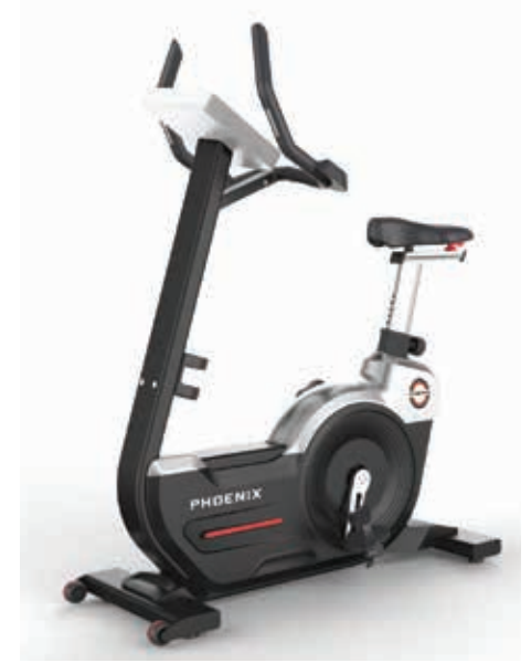
A5200 Upright Bike

Resistance: Magnetron Dimension: 163 x 61 x 130 cm Weight: 100 kg