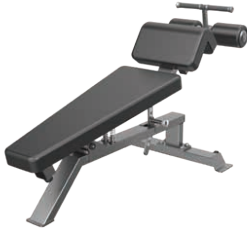
E3037 Adjustable Decline Bench

Tube Thickness: 2.5 mm Dimension: 135 x 76 x 43 cm Weight: 30 kg