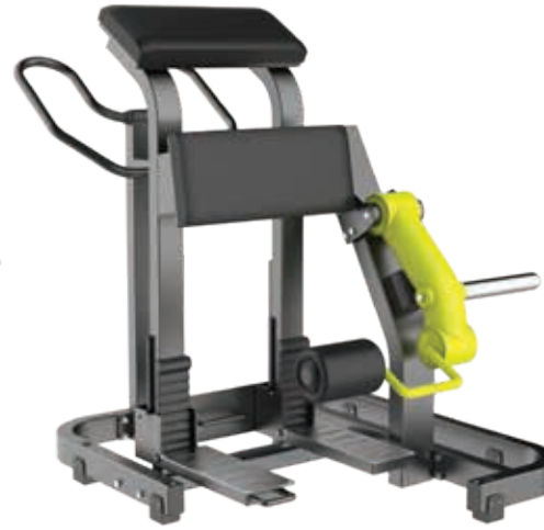
Y955S Leg Curl

Tube Thickness: 3 mm Dimension: 178 x 206 x 152.5 cm Weight: 215 kg