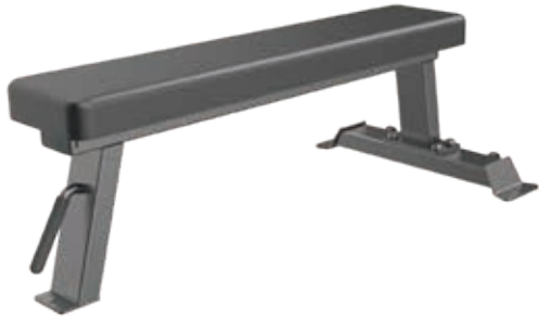
E3036 Flat Bench

Tube Thickness: 2.5 mm Dimension: 135 x 76 x 43 cm Weight: 30 kg