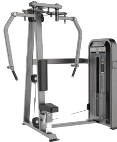
E4007A Pearl Delt/ Pec Fly

Tube Thickness: 2.5 mm Dimension: 190 x 135 x 150 cm Weight: 231 kg