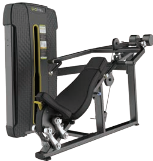
E4013 Incline Press

Tube Thickness: 3 mm Dimension: 155 x 137 x 236 cm Weight: 299 kg