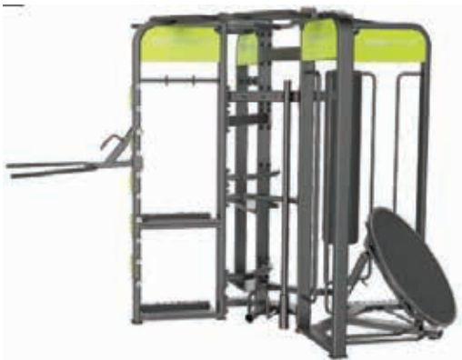
E360 E Small Group Training

Dimension: 510 x 191 x 236 cm Weight: 605 kg