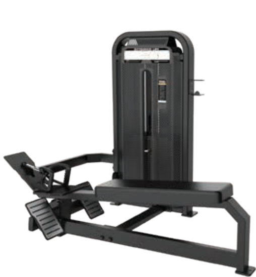
E4033A Long Pull

Tube Thickness: 2.5 mm Dimension: 121 x 100 x 150 cm Weight: 235 kg