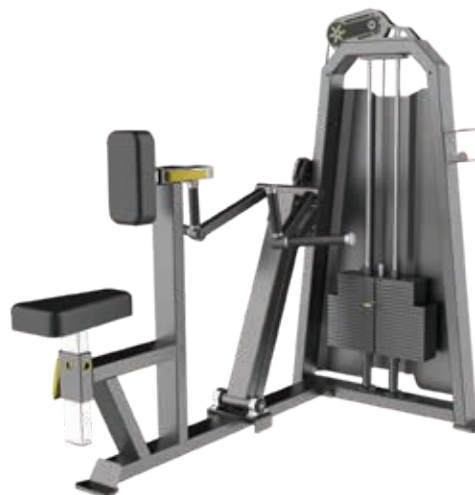
T1034 Vertical Row

Tube Thickness: 2.5 mm Dimension: 282 x 109 x 236 cm Weight: 268 kg