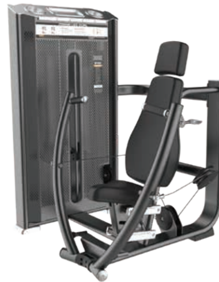
E7008A Vertical Press

Tube Thickness: 3 mm Dimension: 128 x 143 x 207.5 cm Weight: 242 kg