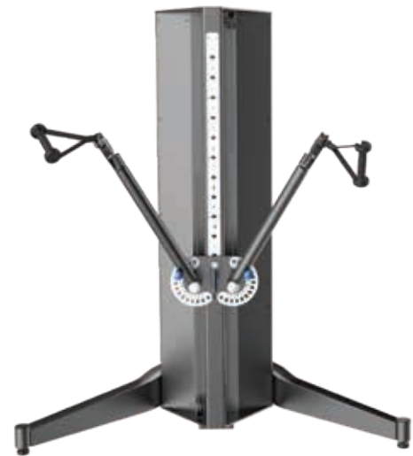
EMI1000 Dual Cable Cross

Tube Thickness: 3 mm Dimension: 192 x 168 x 229 cm Weight: 510 kg