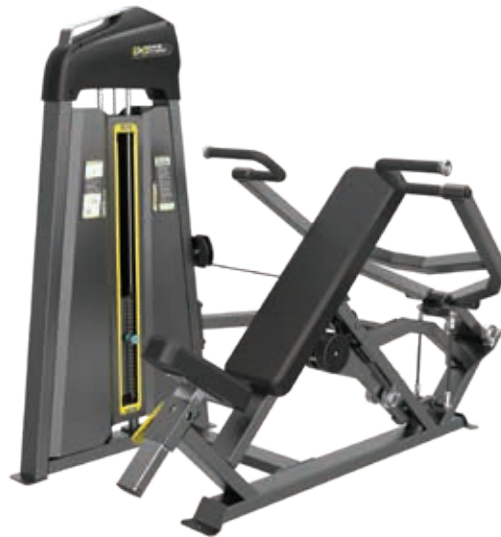
E3006 Shoulder Press

Tube Thickness: 2.5 mm Dimension: 130 x 86 x 162cm Weight: 173 kg