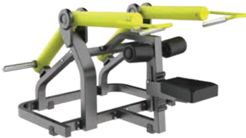
Y965S Seated Dip

Tube Thickness: 3 mm Dimension: 119 x 138 x 130 cm Weight: 135 kg