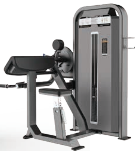
E5087 Camber Curl and Triceps

Tube Thickness: 2.5 mm Dimension: 164.5 x 124.5 x 136cm Weight: 235 kg