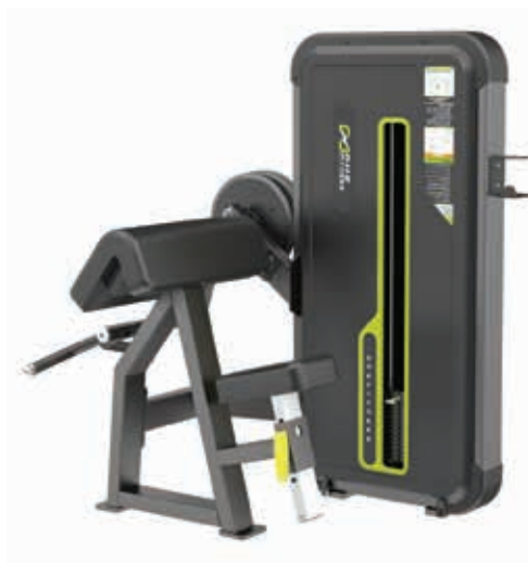
E3030A Camber Curl

Tube Thickness: 2.5 mm Dimension: 111 x 95 x 150 cm Weight: 191 kg