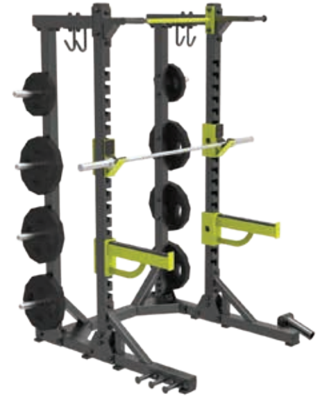
E6227 Half Rack

Tube Thickness: 3 mm Dimension: 211 x 180 x 246.5 cm Weight: 300 kg