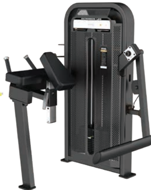
E4024A Glute Isolator

Tube Thickness: 2.5 mm Dimension: 158 x 105 x 150 cm Weight: 220 kg