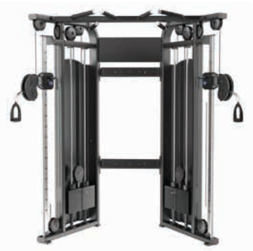
E1017F Home Functional Trainer

Tube Thickness: 3 mm Dimension: 104 x 134 x 199 cm Weight: 282 kg