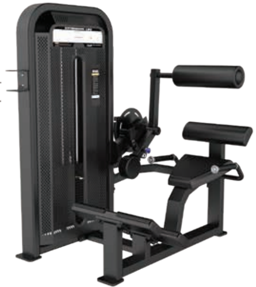
E4031A Back Extension

Tube Thickness: 2.5 mm Dimension: 120 x 91 x 150 cm Weight: 162 kg