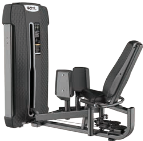
E4089 Abductor and Adductor

Tube Thickness: 3 mm Dimension: 152 x 124.5 x 187.5cm Weight: 250 kg