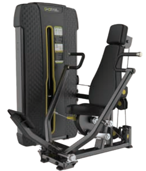
E4008 Vertical Press

Tube Thickness: 3 mm Dimension: 124 x 94 x 211 cm Weight: 247 kg