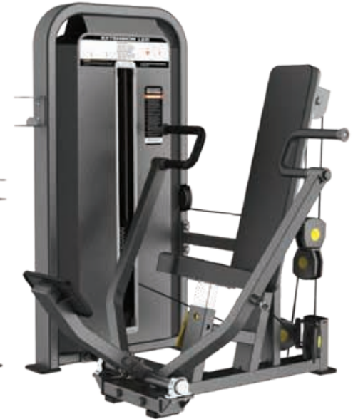
E5008 Vertical Press

Tube Thickness: 2.5 mm Dimension: 124 x 94 x 211 cm Weight: 227 kg