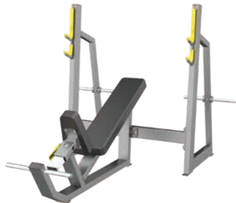
E3042 Olympic Incline Bench

Tube Thickness: 2.5 mm Dimension: 206 x 178 x 109 cm Weight: 110 kg