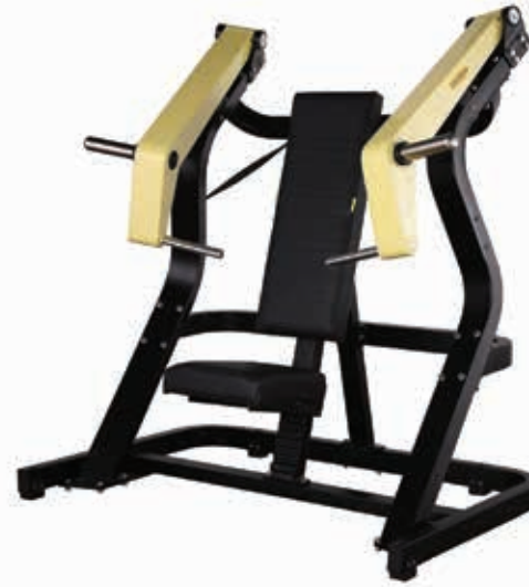
D915S Incline Chest Press

Tube Thickness: 3 mm Dimension: 145 x 118.2 x 171.5 cm Weight: 170 kg