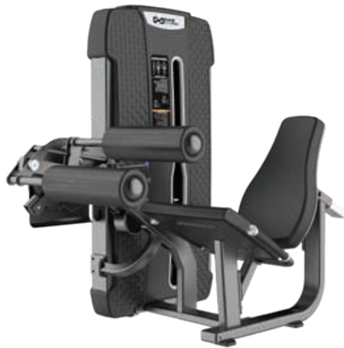
E4086 Leg Extension and Leg Curl

Tube Thickness: 3 mm Dimension: 200 x 135 x 162 cm Weight: 257 kg