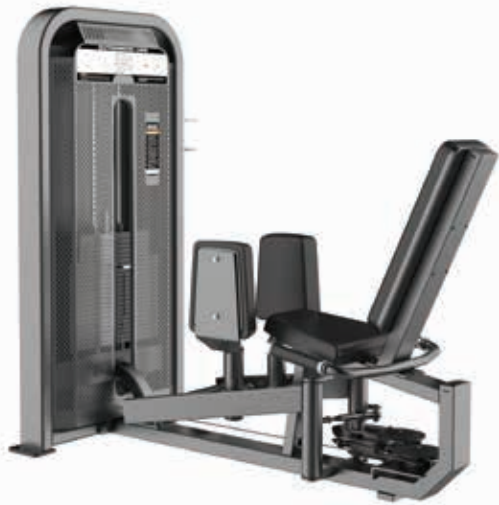
E4089A Abductor and Adductor

Tube Thickness: 2.5 mm Dimension: 152 x 124.5 x 187.5cm Weight: 230 kg