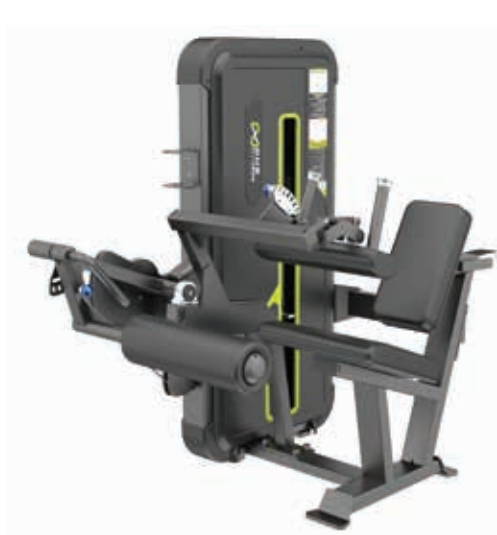
E3023A Seated Leg Curl

Tube Thickness: 2.5 mm Dimension: 105 x 120 x 150 cm Weight: 214 kg