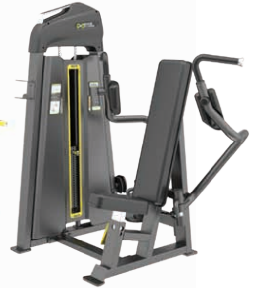
E3004 Pectoral Machine

Tube Thickness: 2.5 mm Dimension: 190 x 110 x 162 cm Weight: 220 kg