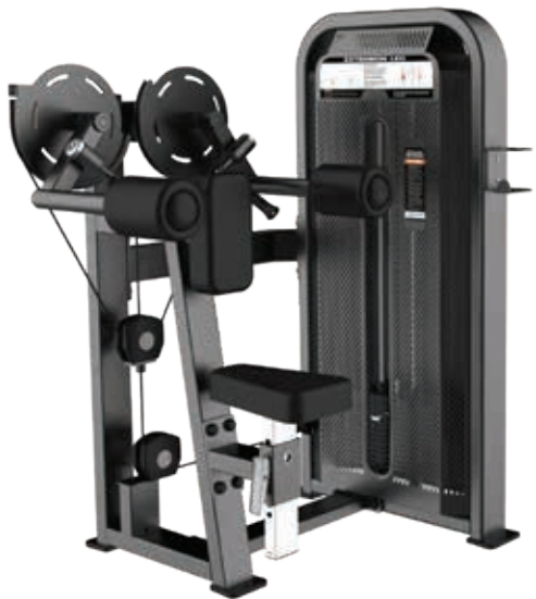
E4005A Lateral Raise

Tube Thickness: 2.5 mm Dimension: 88 x 150 x 150 cm Weight: 208 kg