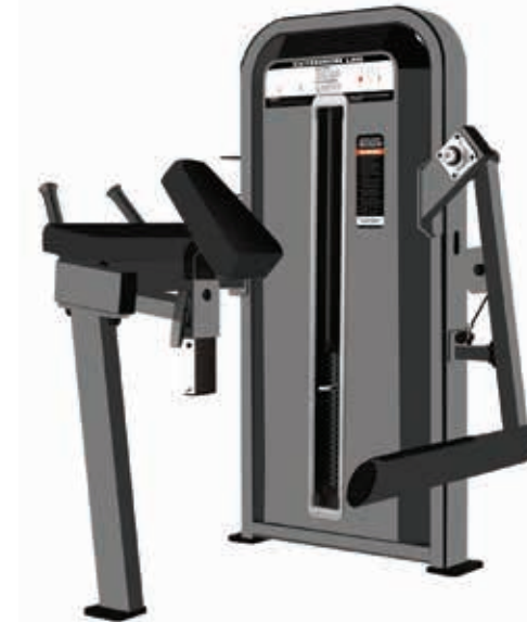
E5024 Glute Isolator

Tube Thickness: 2.5 mm Dimension: 158 x 105 x 150 cm Weight: 220 kg