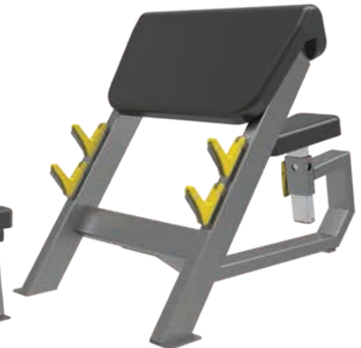
E3044 Seated Preacher Curl

Tube Thickness: 2.5 mm Dimension: 173 x 178 x 122 cm Weight: 82 kg