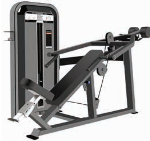
E5013 Incline Press

Tube Thickness: 2.5 mm Dimension: 155 x 137 x 236 cm Weight: 289 kg