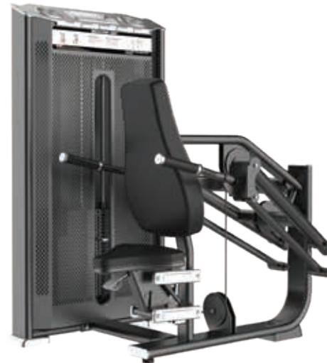
E7026A Seated Dip

Tube Thickness: 3 mm Dimension: 214.5 x 103 x 153 cm Weight: 280 kg