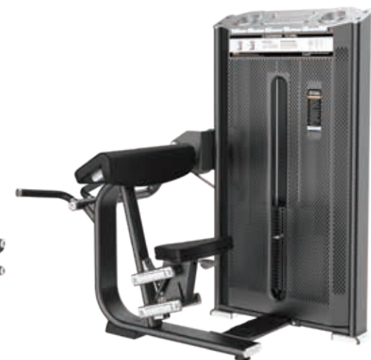
E7030A Camber Curl

Tube Thickness: 3 mm Dimension: 132 x 105.5 x 153 cm Weight: 255 kg