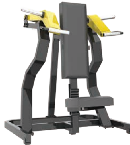
D935S Shoulder Press

Tube Thickness: 3 mm Dimension: 119 x 138 x 130 cm Weight: 135 kg