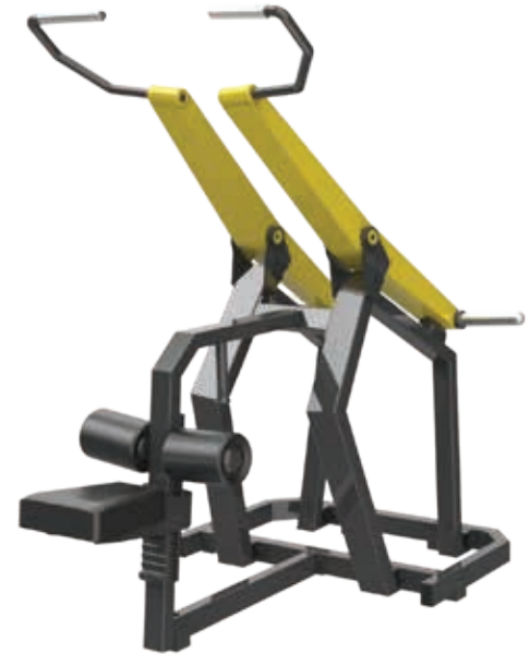
D920Z Pull Down

Tube Thickness: 3 mm Dimension: 154 x 103 x 168.5 cm Weight: 160 kg