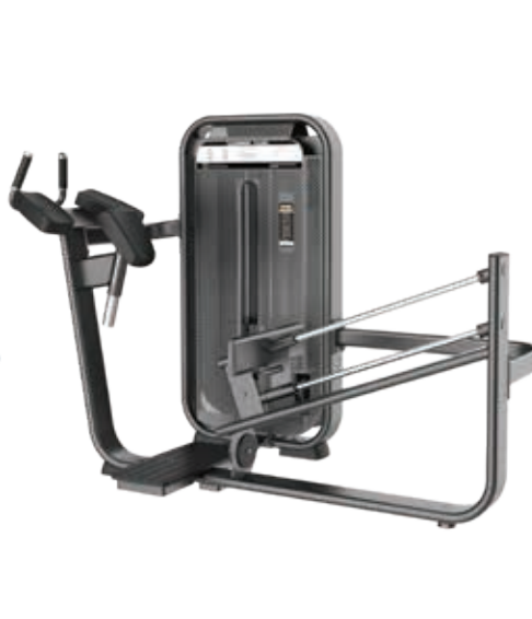
E7024 Glute Isolator

Tube Thickness: 3 mm Dimension: 166.5 x 114.5 x 153 cm Weight: 270 kg