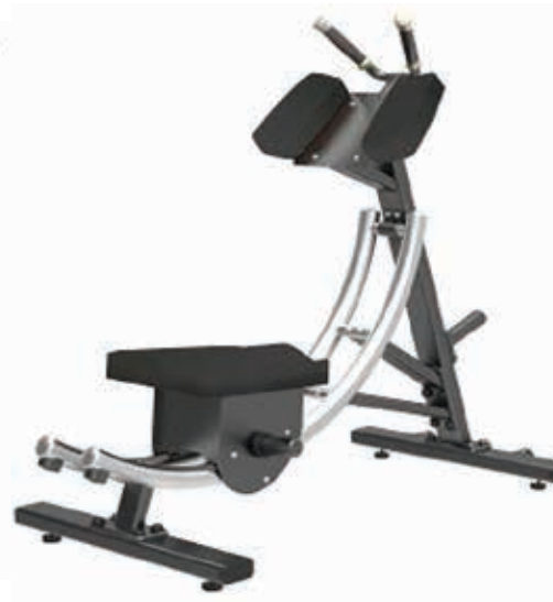
E1082 Glide Abdominal Trainer

Tube Thickness: 3 mm Dimension: 128 x 52 x 106 cm Weight: 35 kg