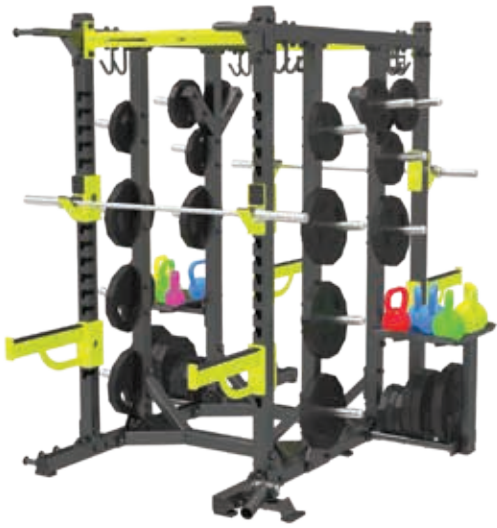
E6224 Combo Rack

Tube Thickness: 3 mm Dimension: 304x 247.5 x 246.5 cm Weight: 490 kg