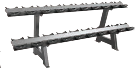
E3077 Dumbbell Rack (10 Pairs)

Tube Thickness: 2.5 mm Dimension: 231 x 107 x 204 cm Weight: 110 kg