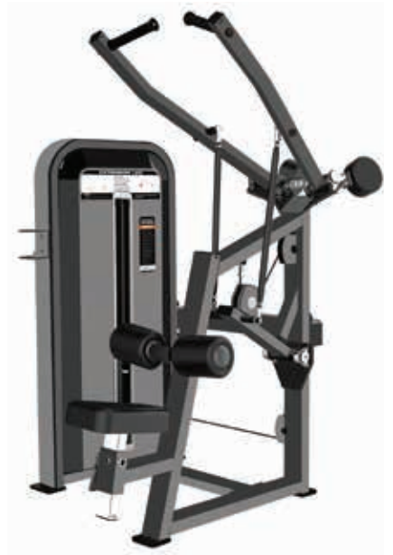
E5034 Vertical Row

Tube Thickness: 2.5 mm Dimension: 150 x 130 x 150 cm Weight: 268 kg