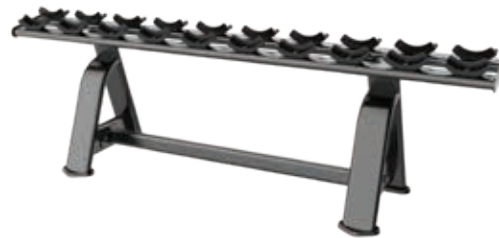
E7067 Dumbbell Rack

Tube Thickness: 3 mm Dimension: 209 x 150 x 233 cm Weight: 235 kg