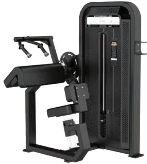
E4028A Triceps Extension

Tube Thickness: 2.5 mm Dimension: 120 x 98 x 150 cm Weight: 191 kg