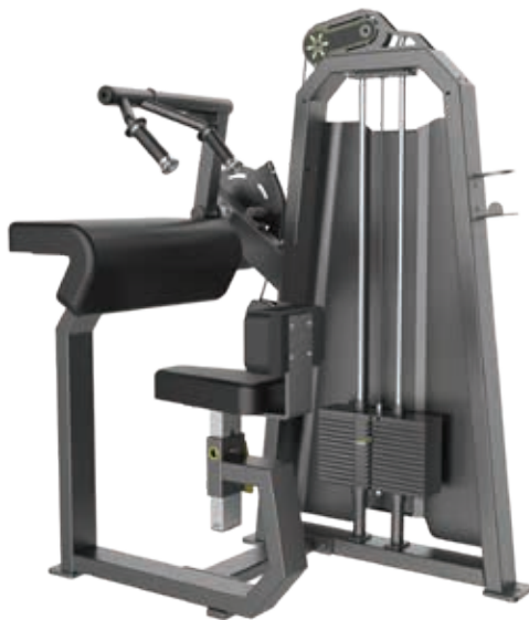
T1027 Seated Tricep Flat

Tube Thickness: 2.5 mm Dimension: 140 x 107 x 135cm Weight: 230 kg