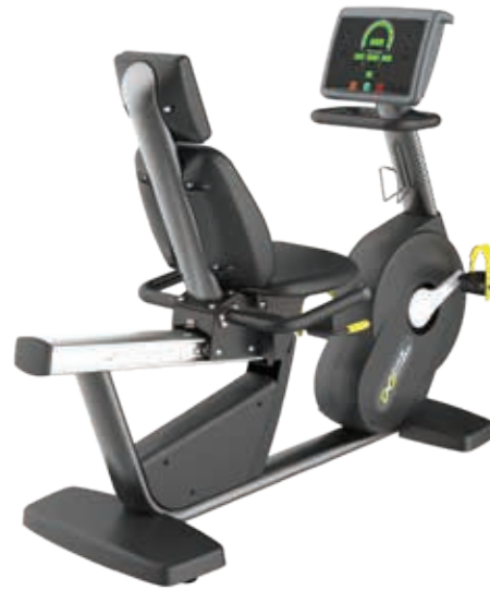
X9109 Recumbent Bike

Resistance: Magnetron Dimension: 119 x 60 x 137 cm Weight: 85 kg