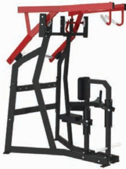
2006Z High Row

Tube Thickness: 2.5 mm Dimension: 166 x 116 x 211cm Weight: 148 kg