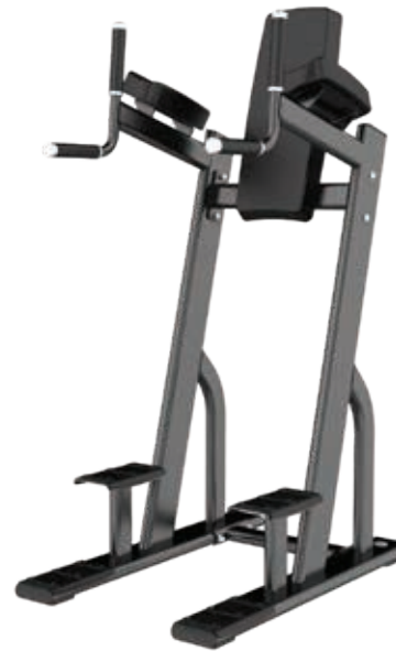
E7047 Vertical Knees Up/Dip

Tube Thickness: 3 mm Dimension: 152 x 79 x 83 cm Weight: 55 kg