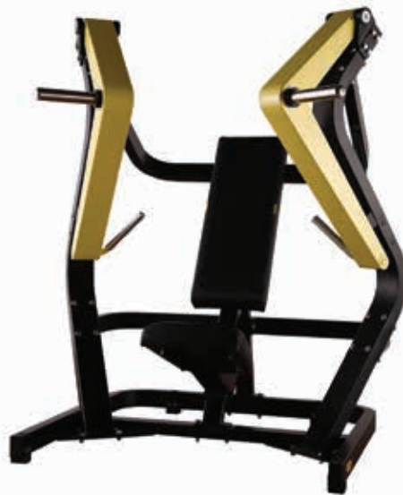
D910S Wide Chest Press

Tube Thickness: 3 mm Dimension: 150 x 120 x 171.5 cm Weight: 164 kg