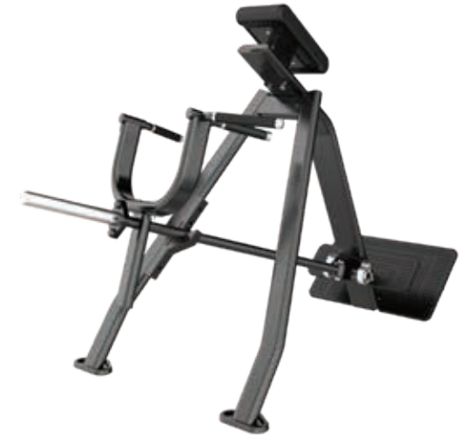
E7061 Incline Level Row

Tube Thickness: 3 mm Dimension: 99x 85 x 132 cm Weight: 70 kg