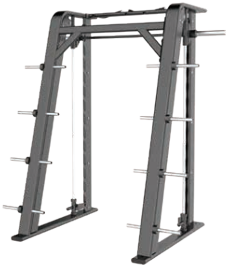
E7063 Smith Machine

Tube Thickness: 3 mm Dimension: 177 x 116 x 127.5 cm Weight: 75 kg