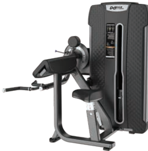
E4087 Camber Curl and Triceps

Tube Thickness: 3 mm Dimension: 164.5 x 124.5 x 136 cm Weight: 255 kg