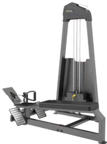
E3033 Long Pull

Tube Thickness: 2.5 mm Dimension: 130 x 89 x 162 cm Weight: 240 kg