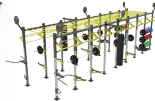
E6207 Monkey Multi Bridge

Tube Thickness: 3 mm Dimension: 642 x 162 x 261 cm Weight: 355 kg