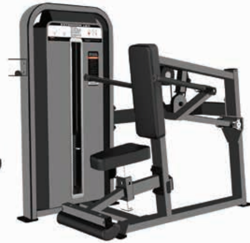
E5026 Seated Dip

Tube Thickness: 2.5 mm Dimension: 130 x 96 x 150 cm Weight: 135 kg