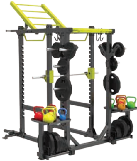
E6225 Multi Rack

Tube Thickness: 3 mm Dimension: 304x 247.5 x 246.5 cm Weight: 490 kg