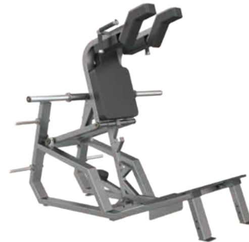
E3065 Super Squat

Tube Thickness: 2.5 mm Dimension: 109 x 218 x 232 cm Weight: 167 kg