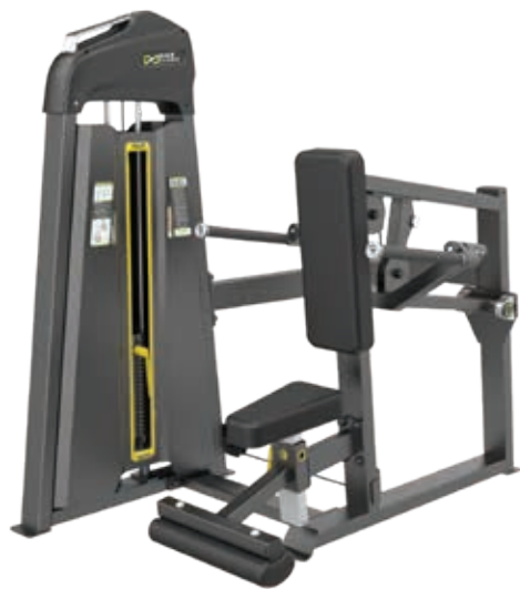
E3026 Seated Dip

Tube Thickness: 2.5 mm Dimension: 140 x 107 x 162cm Weight: 230 kg