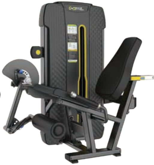
E4002 Leg Extension

Tube Thickness: 3 mm Dimension: 180 x 97 x 150 cm Weight: 216 kg