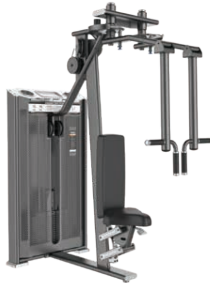
E7007A Pearl Delt/Pec Fly

Tube Thickness: 3 mm Dimension: 155 x 155 x 153 cm Weight: 260 kg