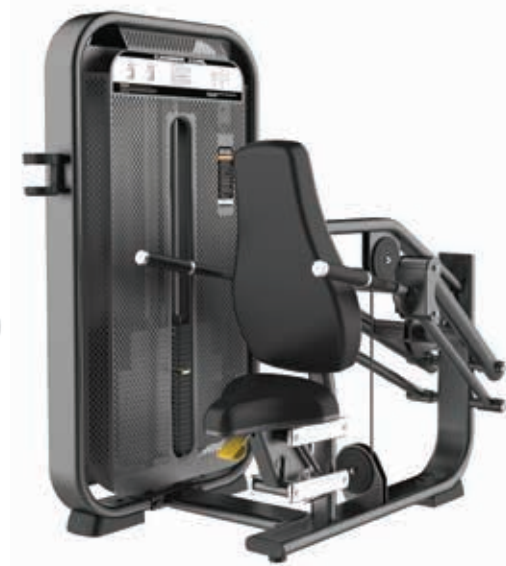
E7026 Seated Dip

Tube Thickness: 3 mm Dimension: 214.5 x 103 x 153 cm Weight: 280 kg