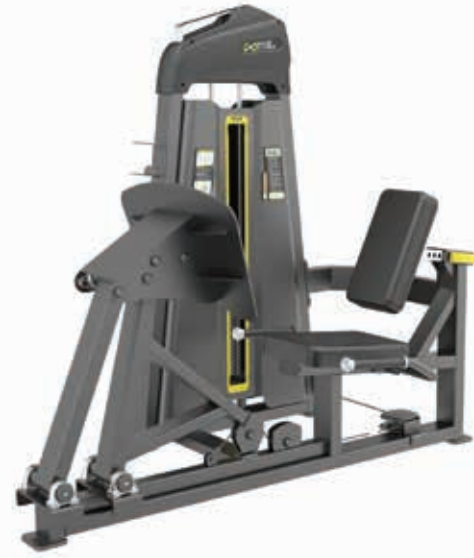
E3003 Leg Press

Tube Thickness: 2.5 mm Dimension: 130 x 99 x 162cm Weight: 223 kg