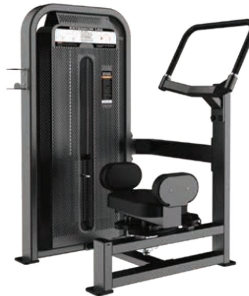
E4018A Rotary Torso

Tube Thickness: 2.5 mm Dimension: 210 x 146 x 150 cm Weight: 215 kg