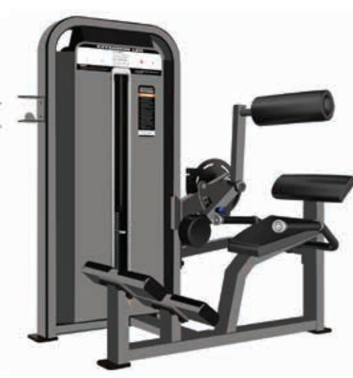
E5031 Back Extension

Tube Thickness: 2.5 mm Dimension: 120 x 91 x 150 cm Weight: 162 kg