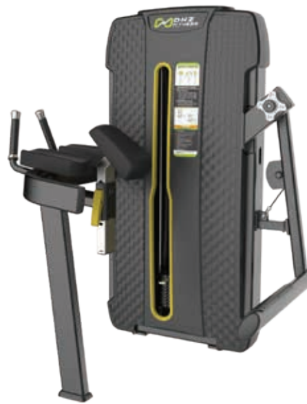
E4024 Glute Isolator

Tube Thickness: 3 mm Dimension: 158 x 105 x 150 cm Weight: 240 kg