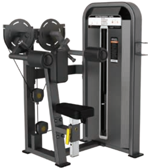
E5005 Lateral Raise

Tube Thickness: 2.5 mm Dimension: 88x 150 x 150 cm Weight: 208 kg