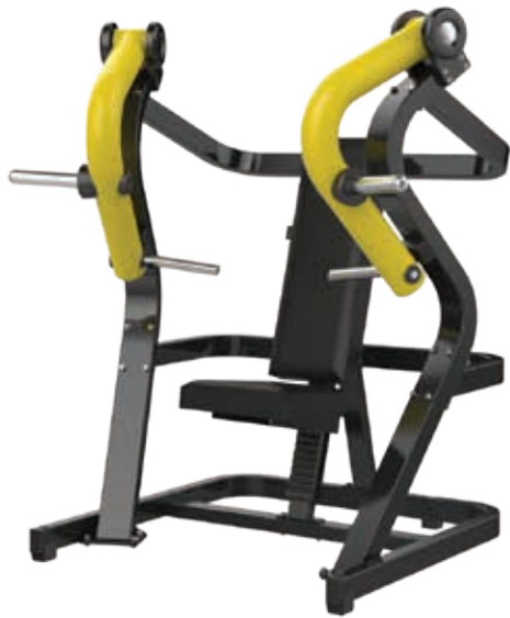
Y905S Chest Press

Tube Thickness: 3 mm Dimension: 150 x 120 x 171.5 cm Weight: 164 kg