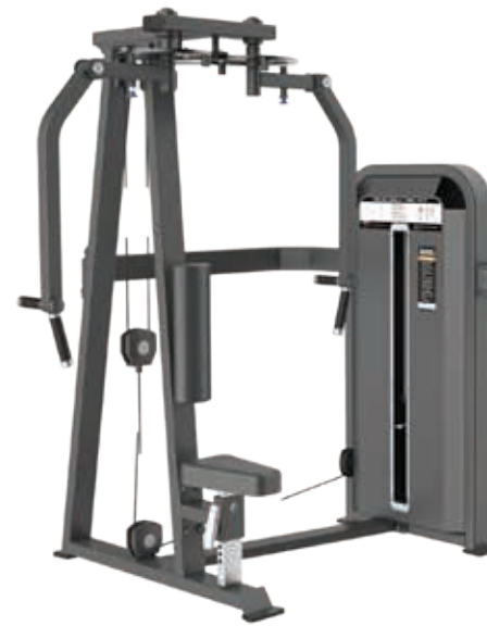
E5007 Pearl Delt/Pec Fly

Tube Thickness: 2.5 mm Dimension: 190 x 135 x 150 cm Weight: 232 kg