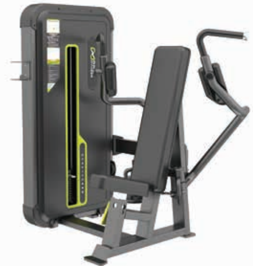
E3004A Pectral Machine

Tube Thickness: 2.5 mm Dimension: 185 x 105 x 150 cm Weight: 255 kg