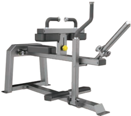
E3062 Seated Calf

Tube Thickness: 2.5 mm Dimension: 185 x 79 x 119 cm Weight: 66 kg