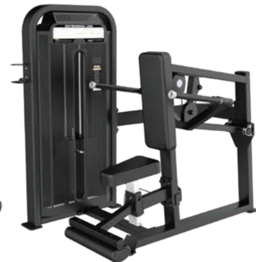
E4026A Seated Dip

Tube Thickness: 2.5 mm Dimension: 130 x 96 x 150 cm Weight: 135 kg