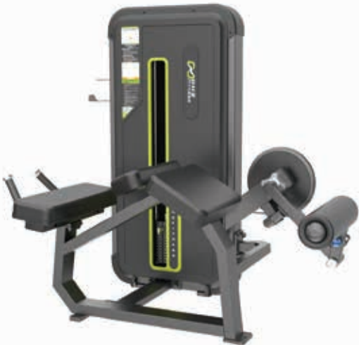
E3001A Prone Leg Curl

Tube Thickness: 2.5 mm Dimension: 180 x 97 x 150 cm Weight: 205 kg