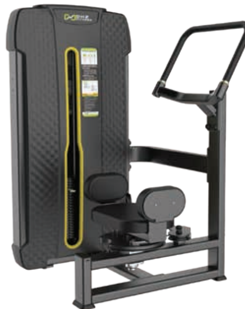
E4018 Rotary Torso

Tube Thickness: 3 mm Dimension: 210 x 146 x 150 cm Weight: 235 kg