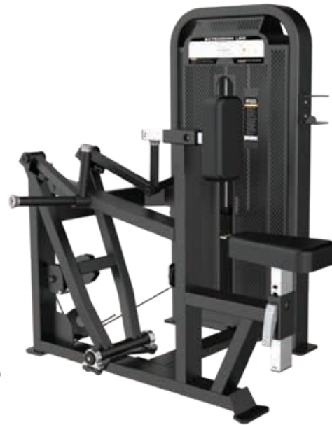
E4034A Vertical Row

Tube Thickness: 2.5 mm Dimension: 282 x 109 x 2235cm Weight: 268 kg