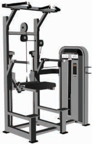
E5009 Dip/Chin Assist

Tube Thickness: 2.5 mm Dimension: 155 x 137 x 236 cm Weight: 289 kg