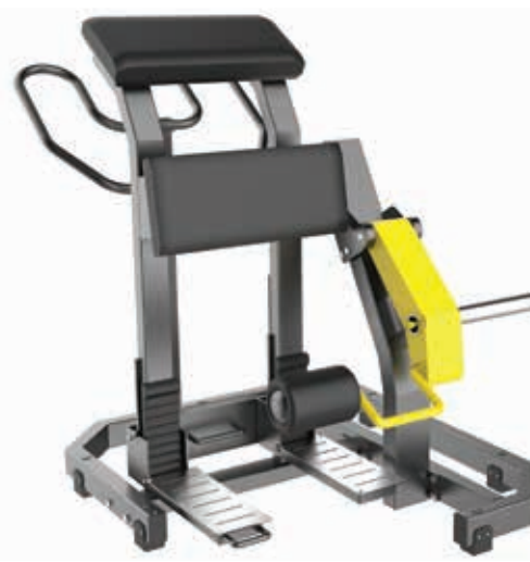
D955Z Leg Curl

Tube Thickness: 3 mm Dimension: 178 x 206 x 152.5 cm Weight: 215 kg