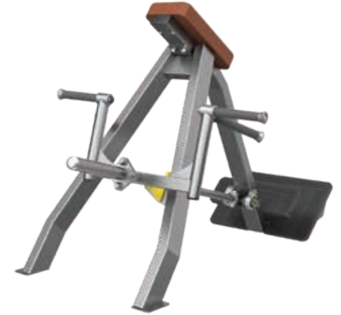
E3061 Incline Level Row

Tube Thickness: 2.5 mm Dimension: 152 x 99 x 135 cm Weight: 216 kg