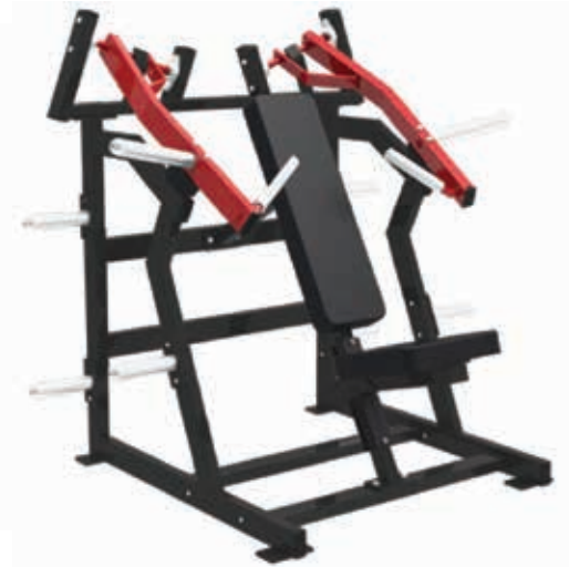
2013Z Super Incline Press

Tube Thickness: 2.5 mm Dimension: 150 x 132 x 134 cm Weight: 125 kg