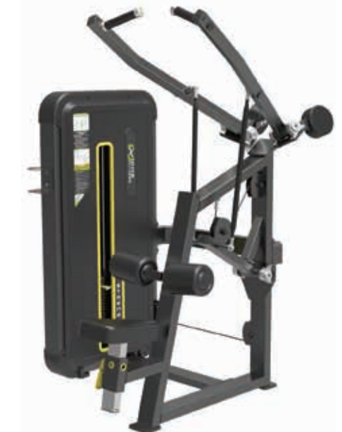
E3035A Pull Down

Tube Thickness: 2.5 mm Dimension: 150 x 130 x 150 cm Weight: 194 kg