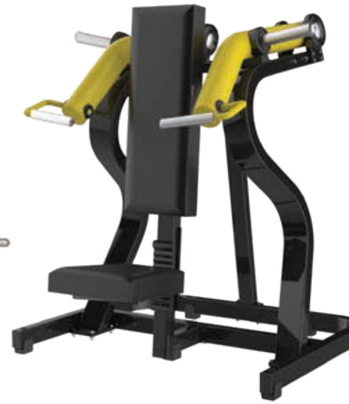
Y935S Shoulder Press

Tube Thickness: 3 mm Dimension: 119 x 138 x 130 cm Weight: 135 kg