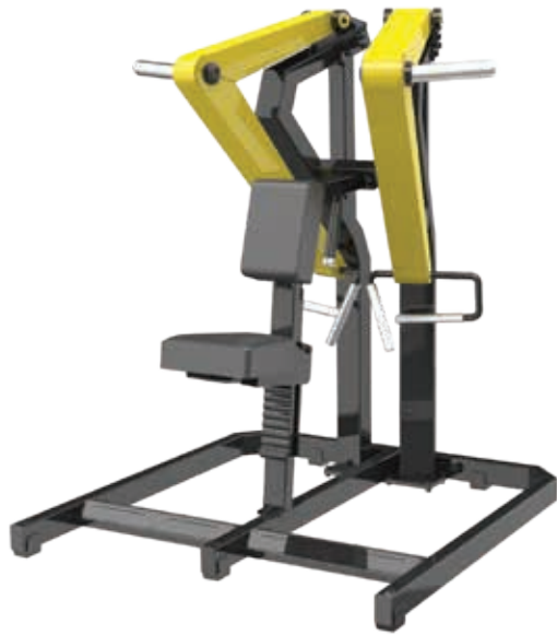
D925Z Low Row

Tube Thickness: 3 mm Dimension: 111 x 174 x 199 cm Weight: 150 kg