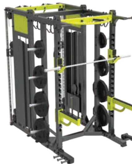
E6222 Combo Rack

Tube Thickness: 3 mm Dimension: 173.5 x 180 x 246.5 cm Weight: 255 kg