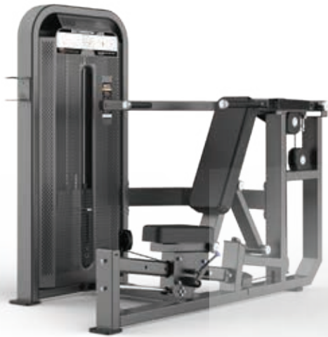
E4084A Chest and Shoulder Press

Tube Thickness: 2.5 mm Dimension: 200 x 135 x 162cm Weight: 237 kg