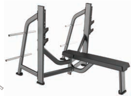
E7043 Olympic Bench

Tube Thickness: 3 mm Dimension: 218.5 x 181 x 157 cm Weight: 90 kg