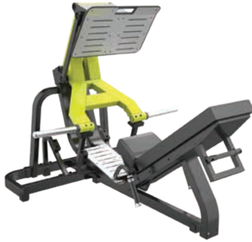
Y950S Leg Press

Tube Thickness: 3 mm Dimension: 112 x 171 x 117 cm Weight: 150 kg