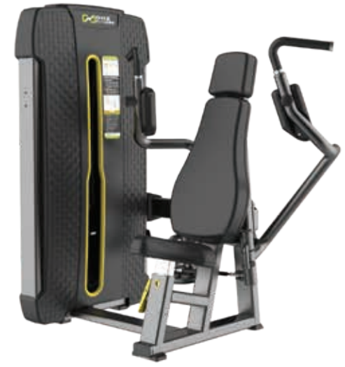
E4004 Pectoral Machine

Tube Thickness: 3 mm Dimension: 185 x 105 x 150 cm Weight: 275 kg