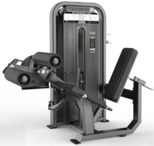
E4086A Leg Extension and Leg Curl

Tube Thickness: 2.5 mm Dimension: 200 x 135 x 162cm Weight: 237 kg