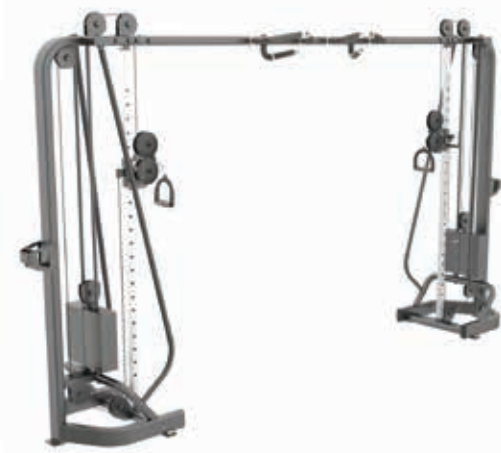
E1016 Cable Crossover Pro

Tube Thickness: 2.5 mm Dimension: 447 x 109 x 231 cm Weight: 396 kg