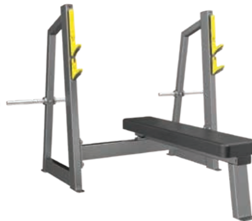
E3043 Olympic Bench

Tube Thickness: 2.5 mm Dimension: 201 x 178 x 140 cm Weight: 127 kg