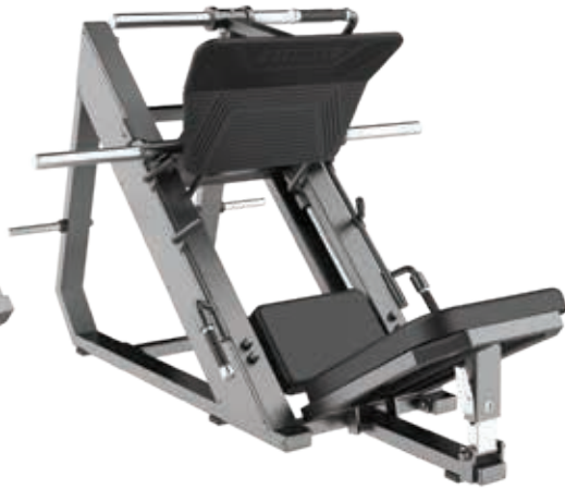
E3056S Angled Leg Press (Linear Bearing)

Tube Thickness: 2.5 mm Dimension: 217 x 161 x 126 cm Weight: 172 kg