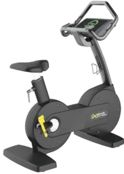
X9107 Upright Bike

Resistance: Magnetron Dimension: 126 x 50 x 100 cm Weight: 41.5 kg