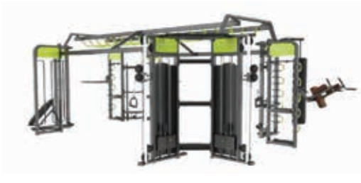
E360 A Small Group Training

Dimension: 860 x 521 x 256 cm Weight: 1500 kg