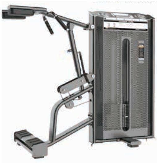
E7010A Standing Calf

Tube Thickness: 3 mm Dimension: 186 x 82 x 153 cm Weight: 280 kg