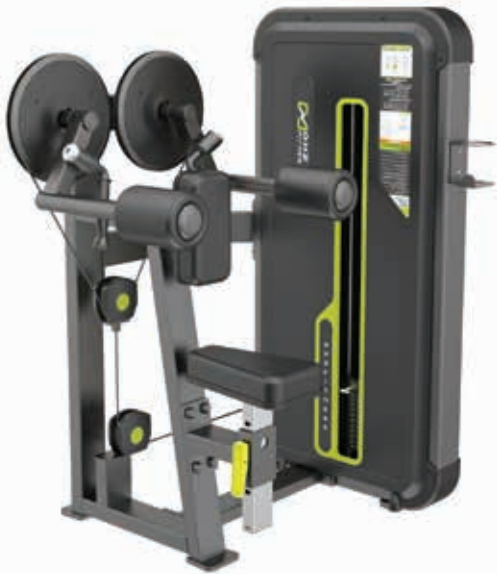
E3005A Lateral Raise

Tube Thickness: 2.5 mm Dimension: 88 x 150 x 150 cm Weight: 208 kg