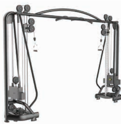
D824A Cable Crossover Ultimate

Tube Thickness: 3 mm Dimension: 450 x 109 x 231 cm Weight: 416 kg