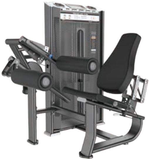
E7023A Seated Leg Curl

Tube Thickness: 3 mm Dimension: 162.5 x 81.5 x 153 cm Weight: 265 kg