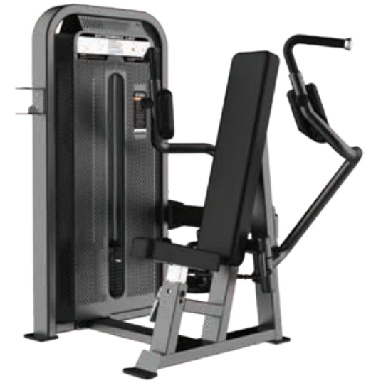
E4004A Pectoral Machine

Tube Thickness: 2.5 mm Dimension: 185 x 105 x 150 cm Weight: 255 kg