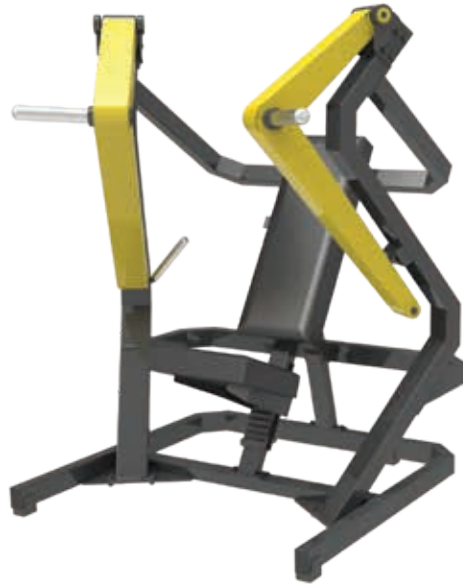
D910Z Wide Chest Press

Tube Thickness: 3 mm Dimension: 150 x 120 x 171.5 cm Weight: 164 kg