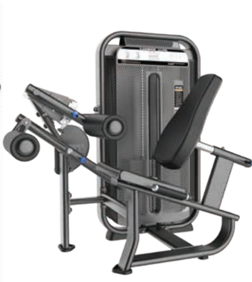
E7023 Seated Leg Curl

Tube Thickness: 3 mm Dimension: 162.5 x 81.5 x 152.8 cm Weight: 265 kg