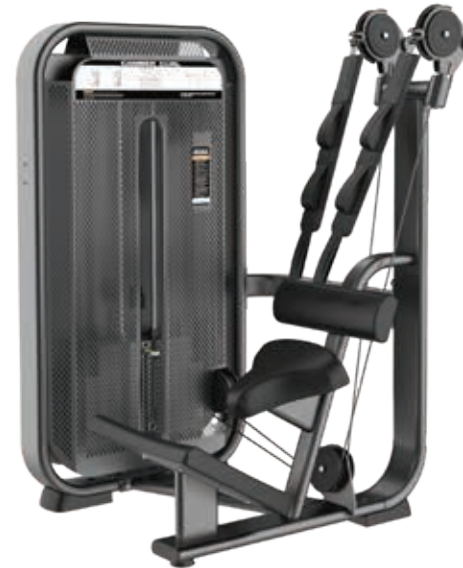
E7073 Abdominal Isolator

Tube Thickness: 3 mm Dimension: 229.5 x 595 x 725 cm Weight: 57 kg