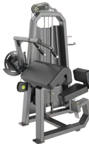
T1028 Triceps Extension

Tube Thickness: 2.5 mm Dimension: 114 x 94 x 147cm Weight: 191 kg