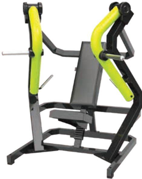
Y910Z Wide Chest Press

Tube Thickness: 3 mm Dimension: 150 x 120 x 171.5 cm Weight: 164 kg