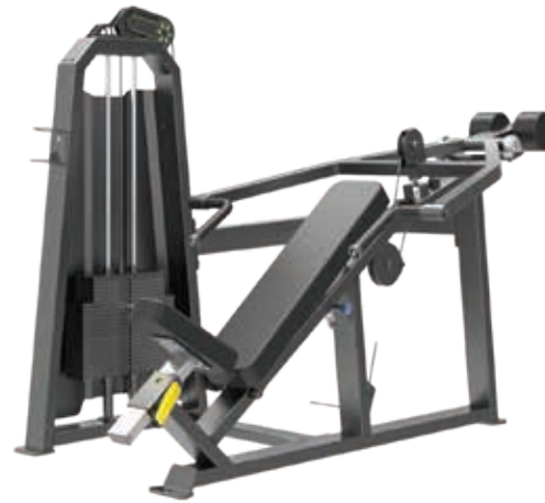
T1013 Incline Press

Tube Thickness: 2.5 mm Dimension: 131 x 115 x 163cm Weight: 179 kg