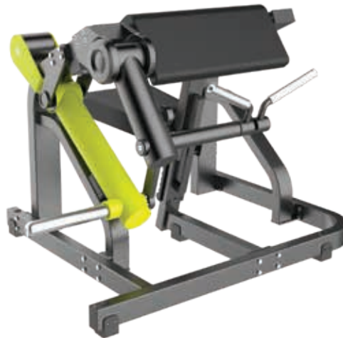
Y970S Biceps Curl

Tube Thickness: 3 mm Dimension: 111.5 x 133 x 165 cm Weight: 140 kg