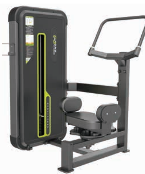
E3018A Rotary Torso

Tube Thickness: 2.5 mm Dimension: 210 x 146 x 150 cm Weight: 215 kg