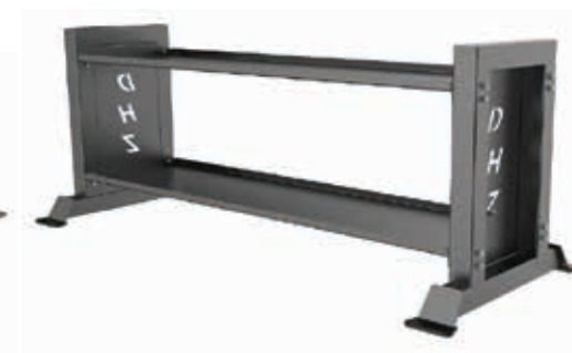
E6234 KettleBell Tray

Tube Thickness: 3 mm Dimension: 143.5 x 74 x 43.2 cm Weight: 52 kg