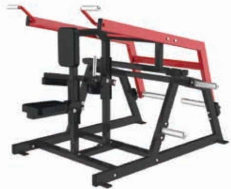
2018Z Seated Dip

Tube Thickness: 2.5 mm Dimension: 182 x 113 x 195 cm Weight: 155 kg