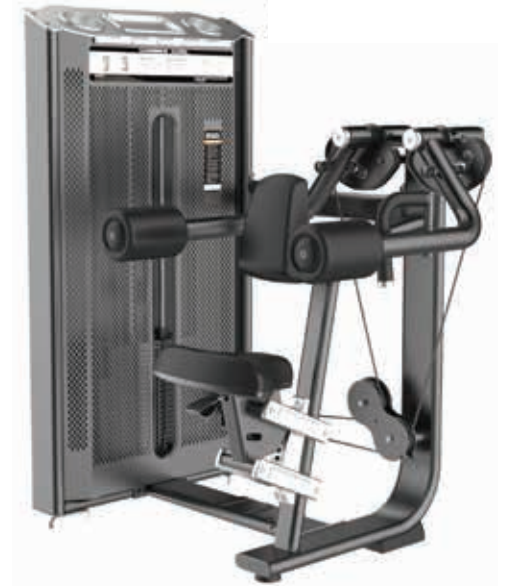
E7005A Lateral Raise

Tube Thickness: 3 mm Dimension: 128 x 143 x 207.5 cm Weight: 242 kg