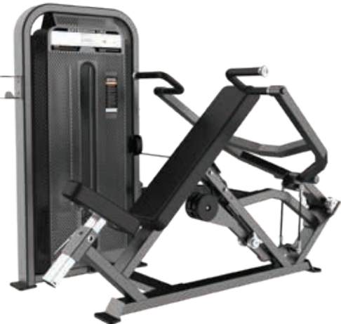
E4006A Shoulder Press

Tube Thickness: 2.5 mm Dimension: 91 x 115 x 150 cm Weight: 195 kg