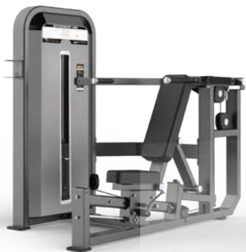
E5084 Chest and Shoulder Press

Tube Thickness: 2.5 mm Dimension: 200 x 135 x 162 cm Weight: 237 kg