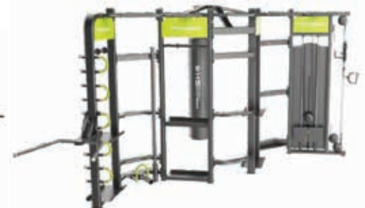
E360 D Small Group Training

Dimension: 660 x 521 x 256 cm Weight: 1320 kg