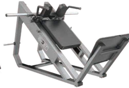
E3057 Hack Slide

Tube Thickness: 2.5 mm Dimension: 217 x 161 x 126 cm Weight: 172 kg