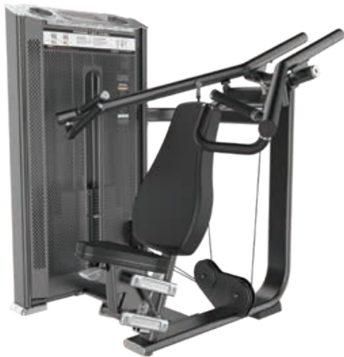
E7006A Shoulder Press

Tube Thickness: 3 mm Dimension: 190 x 110 x 162 cm Weight: 250 kg