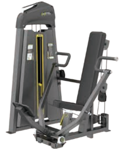
E3008 Vertical Press

Tube Thickness: 2.5 mm Dimension: 124 x 94 x 221 cm Weight: 227 kg