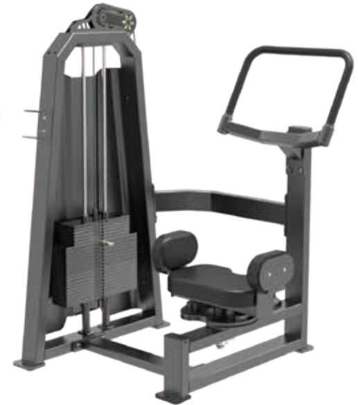
T1018 Rotary Torso

Tube Thickness: 2.5 mm Dimension: 185 x 122 x 132cm Weight: 239 kg