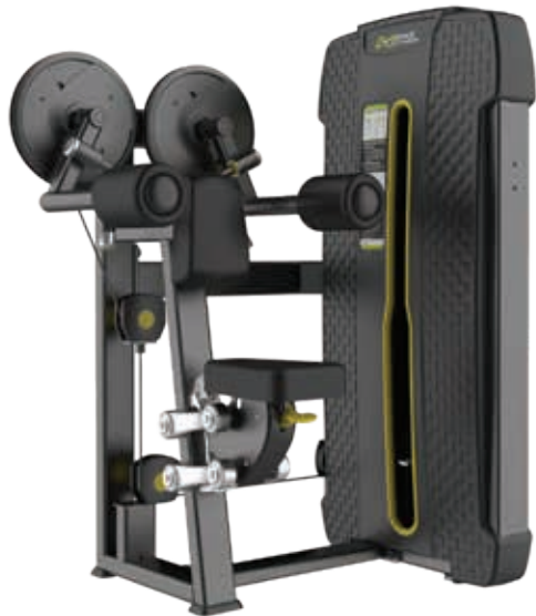
E4005 Lateral Raise

Tube Thickness: 3 mm Dimension: 88 x 150 x 150 cm Weight: 228 kg