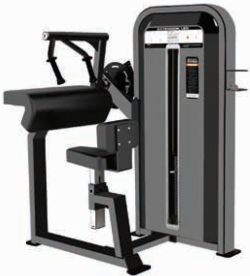
E5027 Seated Tricep Flat

Tube Thickness: 2.5 mm Dimension: 120 x 98 x 150 cm Weight: 191 kg