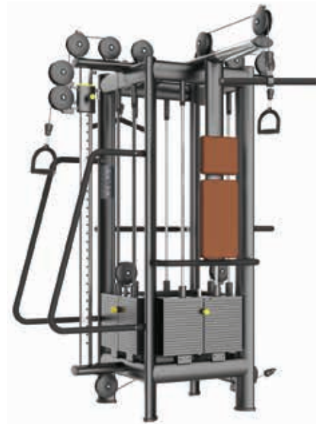
882 Cable Jungle

Tube Thickness: 3 mm Dimension: 157 x 111 x 233 cm Weight: 396 kg